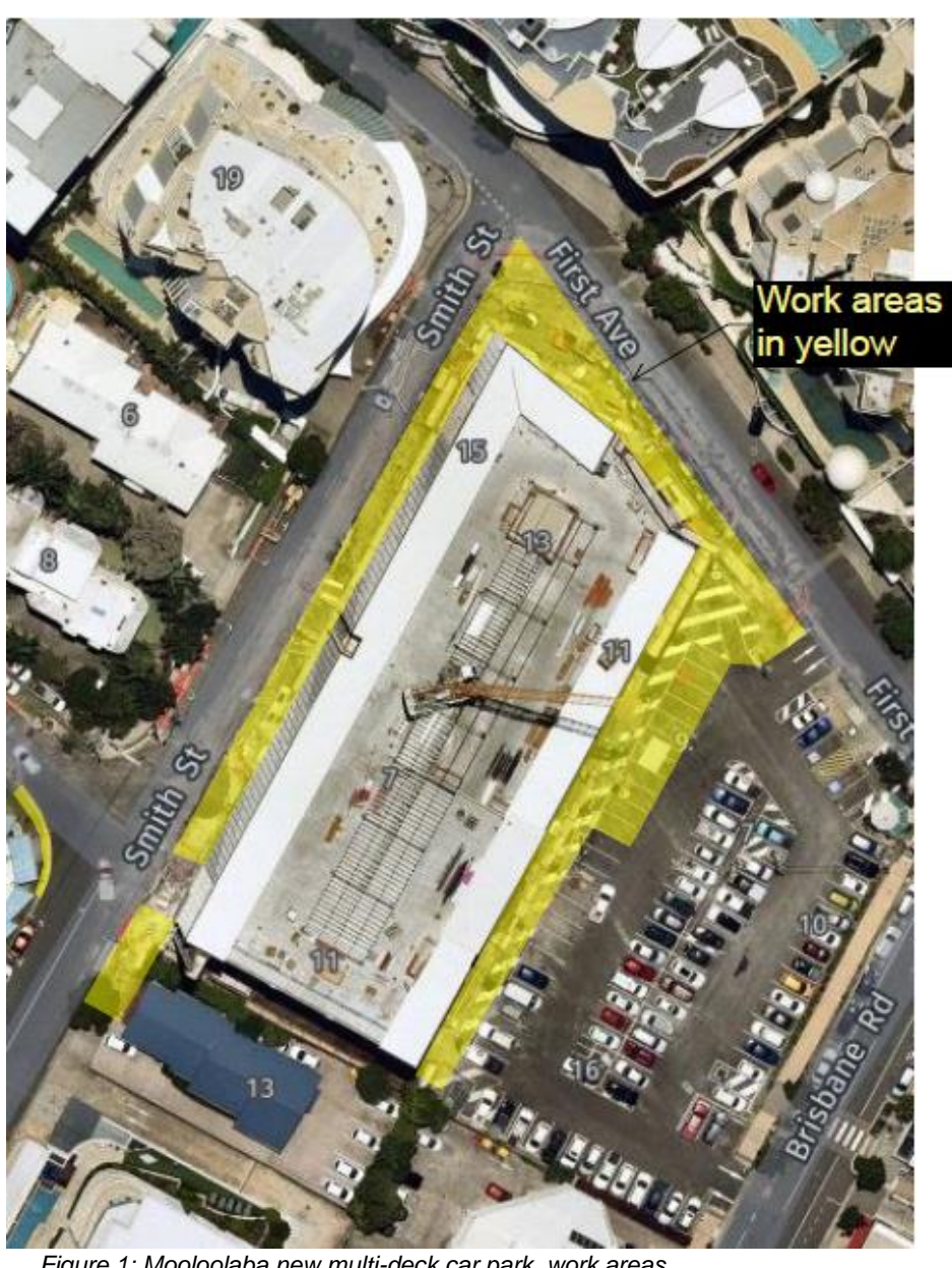
Figure 1: Mooloolaba new multi-deck car park, work areas.

To find out more about the new ParknGo Mooloolaba Central car park visit www.parkngo.com.au