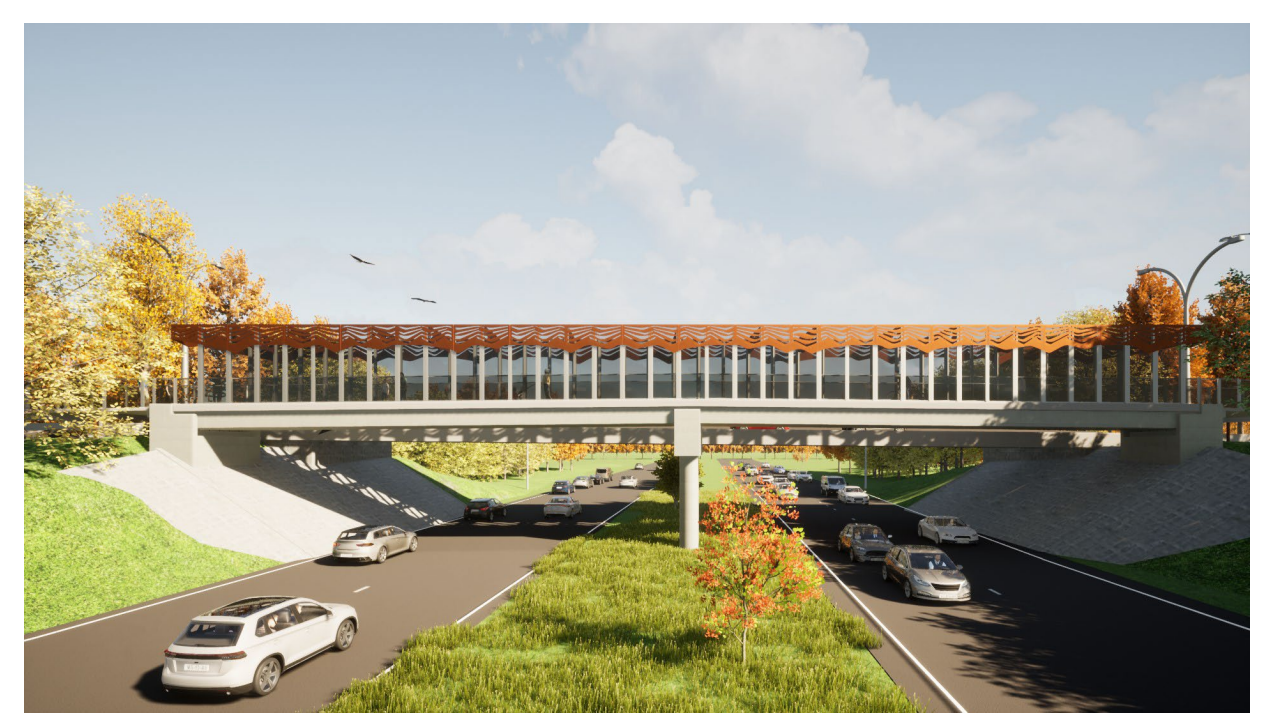
Figure 2: Artist impression of the new pedestrian and cyclist bridge when looking west, toward the existing Stringybark Road bridge.