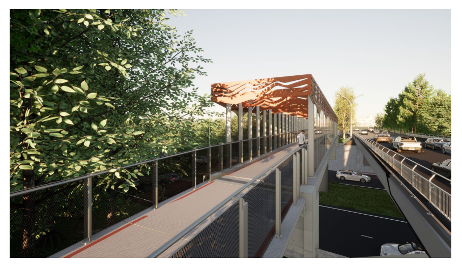
Figure 3: Decorative elements create patterns of light and shade as well as providing protection for users.