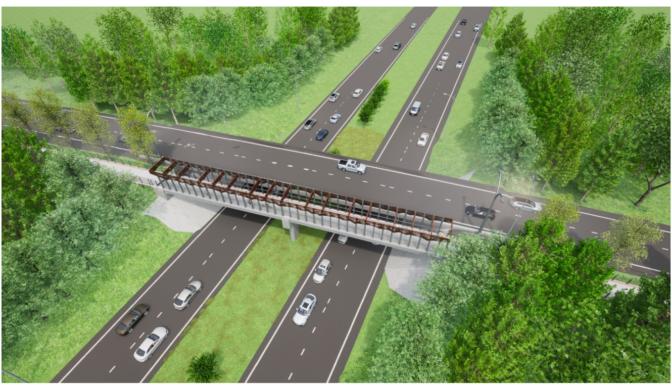
Figure 1: Artist impression (aerial view) of the new, stand-alone pedestrian and cyclist bridge to be constructed on the eastern side of the existing Stringybark Road bridge.

Sunshine Coast Council www.sunshinecoast.qld.gov.au mail@sunshinecoast.qld.gov.au T 07 5475 7272 F 07 5475 7277 Locked Bag 72 Sunshine Coast Mail Centre Qld 4560