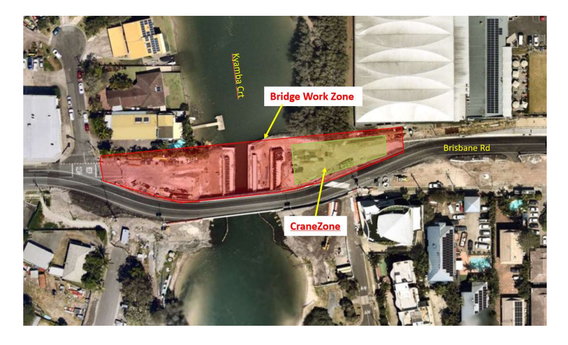
Figure 1. Crane location and western lanes of new Mayes Canal Bridge currently under construction – Brisbane Road *all works are weather and site conditions permitting.

For further information, you can contact the project team on 1800 531 597 (during office hours, Monday to Friday 8.30am – 5pm) or email <a href="mtcu@sunshinecoast.gld.gov.au">mtcu@sunshinecoast.gld.gov.au</a>