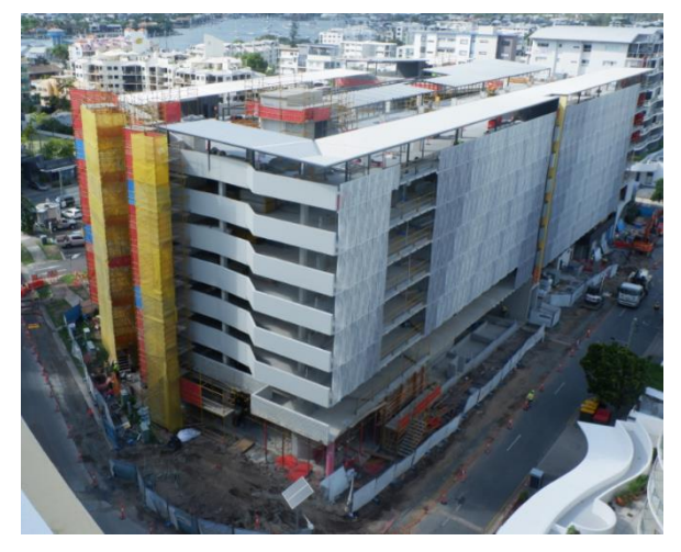
Mooloolaba new eight-storey car park

To see the location of the works area, please refer to the map on page 2.