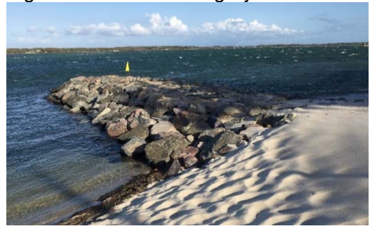
Figure 1: Rock type groyne (SCC, 2017)

There are currently three different types of groynes managed with council. These groynes include rock, hybrid and GSC (geo-synthetic container). A rock groyne consists of layers of placed rock to form a semi-impermeable barrier and typically have a 50-70 year design life. These structures do require high capital expenditure initially to construct but conversely maintenance costs are minimal for the life of the structure, Figure 1 shows a rock groyne.