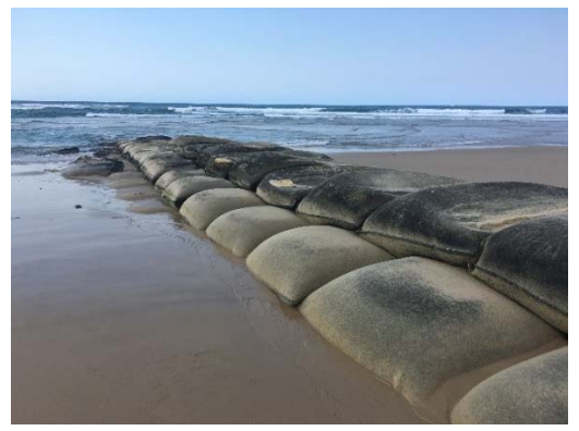
Figure 3: GSC style groyne (SCC, 2017)

The final groyne type is constructed purely from GSC's whereby geofabric is manufactured into a bag then filled with insitu or imported material. The filled bags are sealed and placed in an interlocking fashion to form a structure. The advantage of this method is rapid construction and lower initial construction costs. Figure 3 shows a GSC groyne.