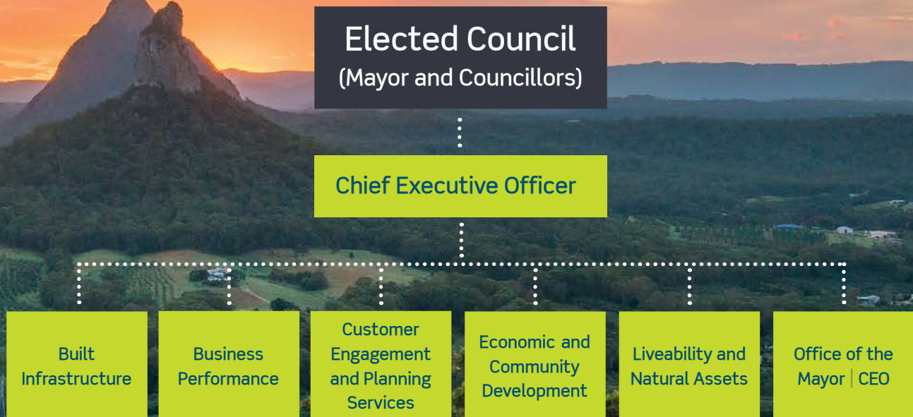
Figure 2: Organisational Structure

Operational activities are also incorporated into Group and Branch Business Plans, as well as individual performance plans. Each Group is responsible for managing the scheduling, delivery, performance and reporting for those activities, projects and services for which they have lead responsibility in line with the commitments and expectations of Council, as well as identifying, managing and monitoring operational risks.