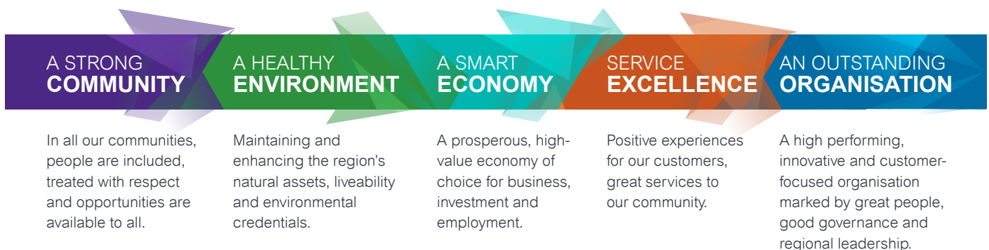
Figure 1: Strategic Goals

Together this structure provides a holistic and integrated approach to deliver on Council's purpose: to serve the community with excellence and position the region for the future .