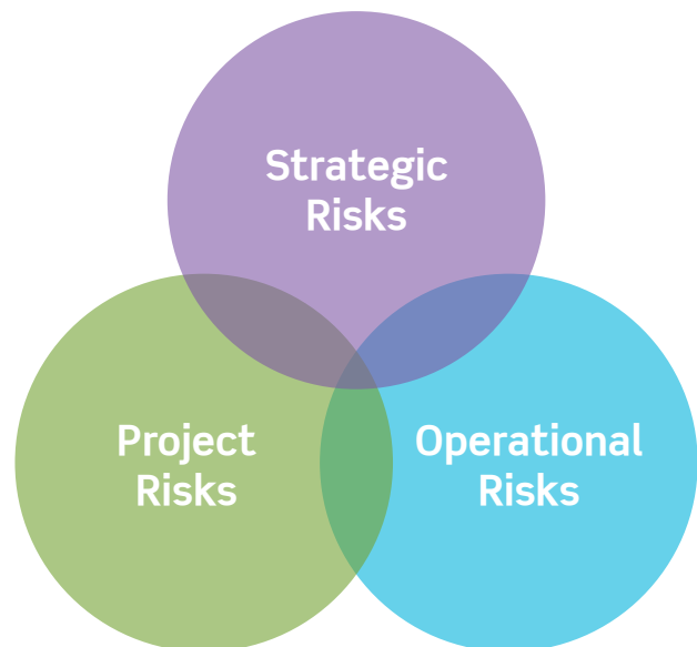
Figure 4: Risk Management

Council regularly reviews, monitors and reports on risks across Council, including strategic risks, operational risks and project risks; this ensures Council continues delivering quality service to the community through its Operational Plan.