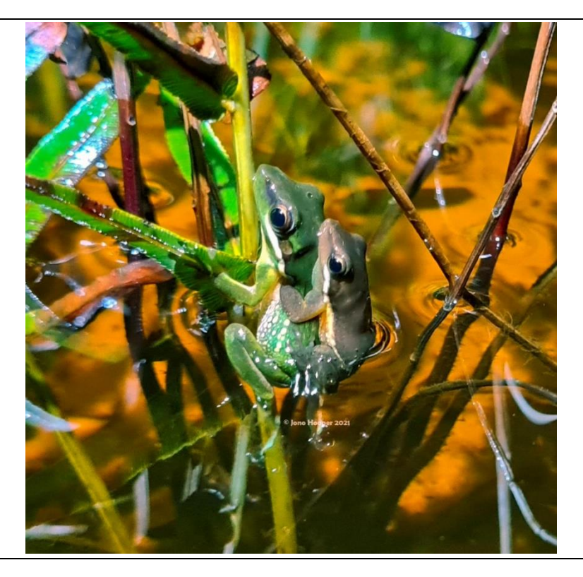
Wallum Sedgefrog in amplexus (mating position) – observed in Vegetation Management Area A breeding pond