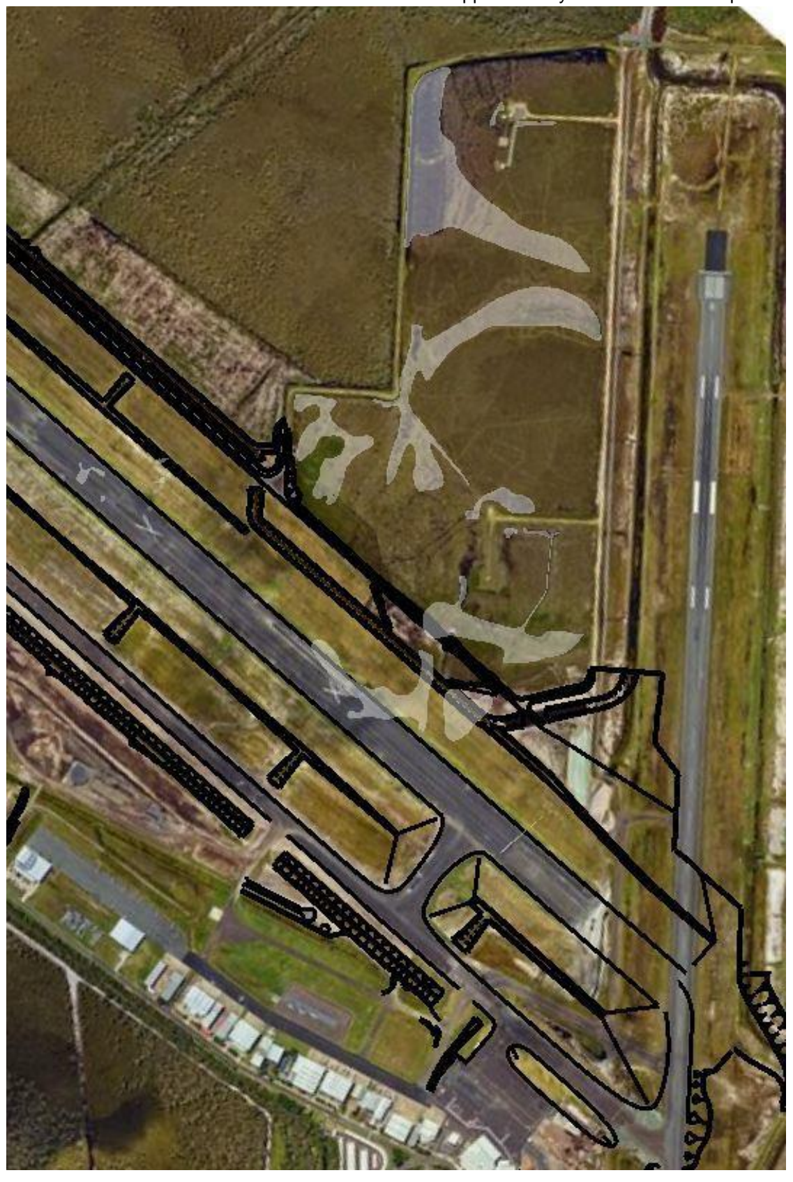
Sunshine Coast Council – Sunshine Coast Airport Expansion Project Compliance Report 14 April 2022 to 13 April 2023 Approval Number - EPBC 2011/5823

Overlay of Wallum Sedgefrog ( Litoria olongburensis ) breeding habitat over aerial imagery showing extent of impact from SCAEP construction works as of 26 March 2020. Approximately 1.19 hectares of impact.