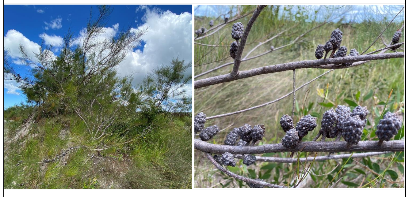
Mt Emu She Oak - Receival area 2