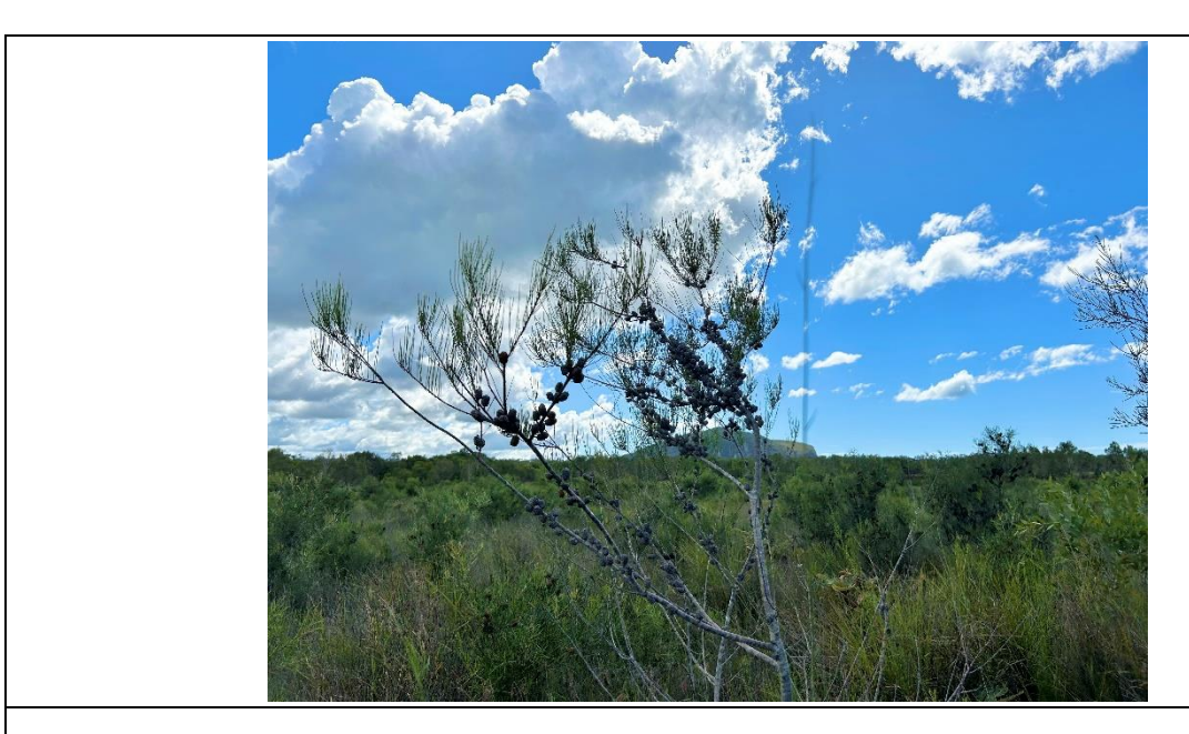
Mt Emu She Oak - Receival area 1

Photographs of progress are shown below: