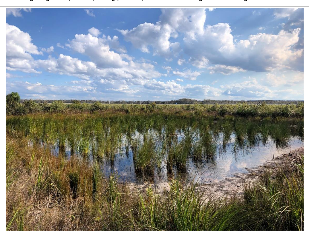
Wallum Sedgefrog offset area – Breeding pond in Vegetation Management Area A