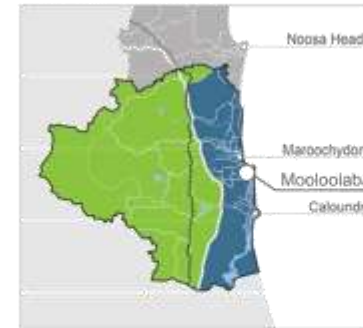
Figure 1: Context Map