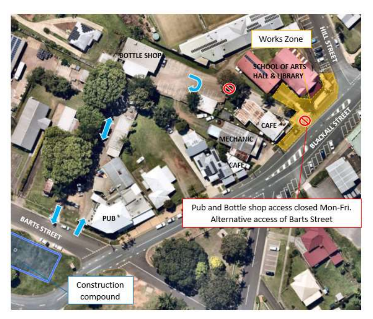
Figure Two. Temporary access changes to pub and bottle shop. Each Monday to Friday afternoon. All works subject to weather and site conditions