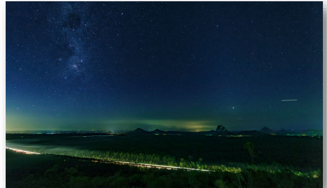
P.Tyrer, Wild Horse Mountain

Light pollution is excessive use of artificial light. When outdoor lighting is inefficient, overly bright, poorly targeted and/or improperly shielded, light spills into the sky, rather than focusing it on to the actual objects and areas that people want illuminated.