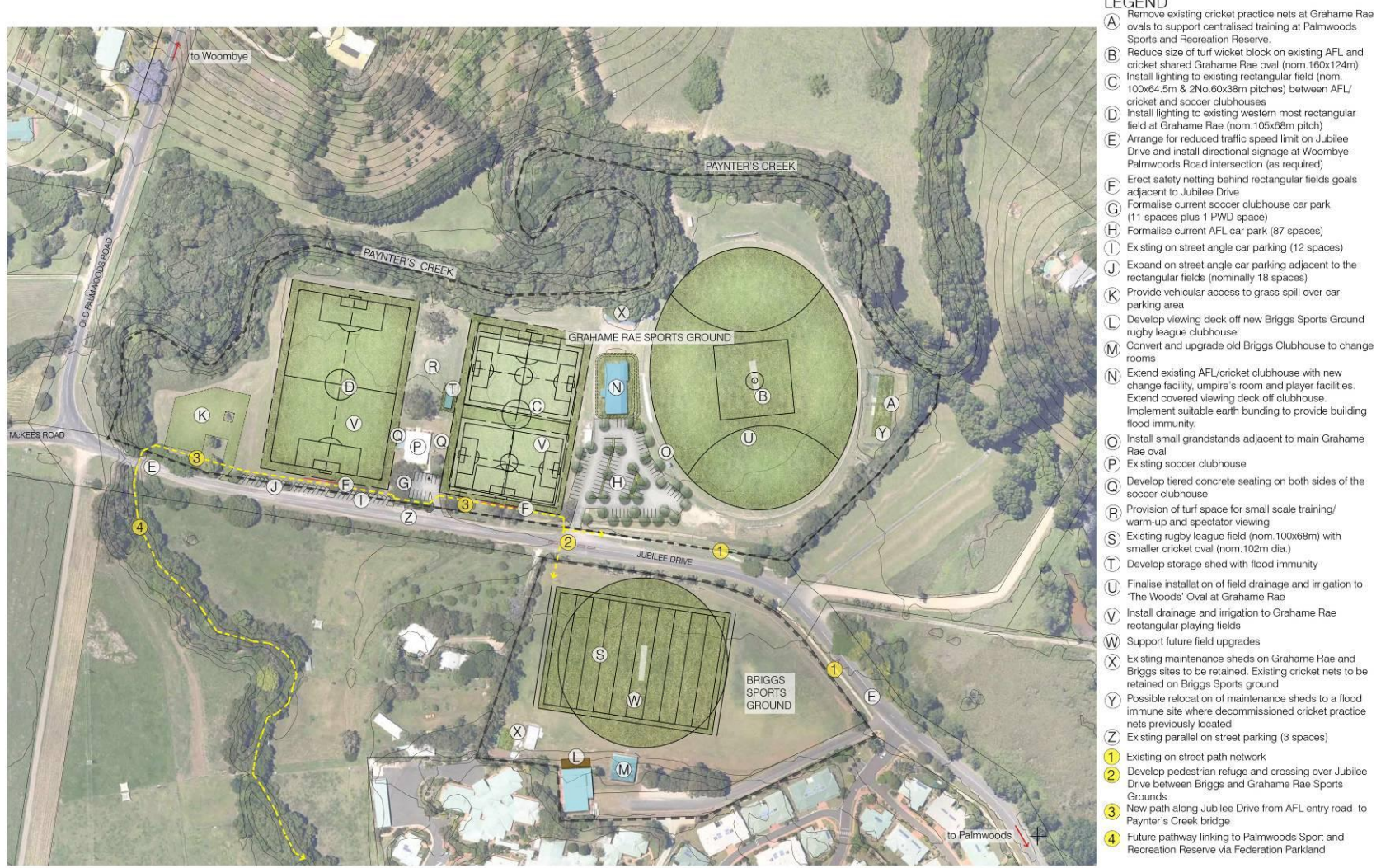
Figure 4- Briggs and Grahame Rae Sports Ground Master Plan

PALMWOODS SPORTS PRECINCT MASTER PLAN Briggs and Grahame Rae Sports Ground