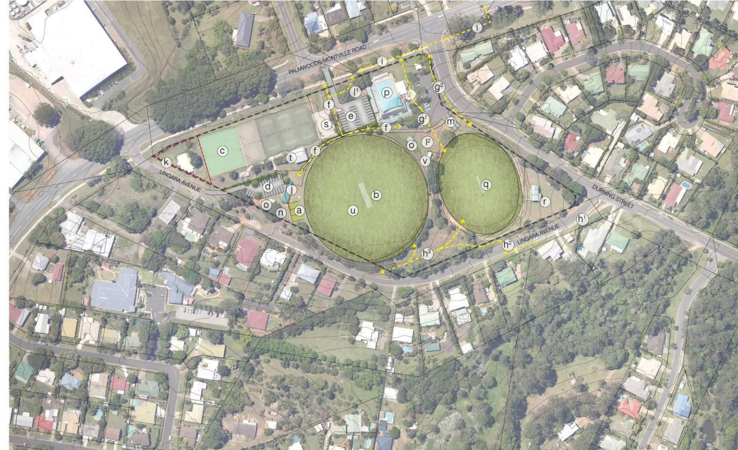
Figure 3- Palmwoods Sport and Recreation Reserve Master Plan