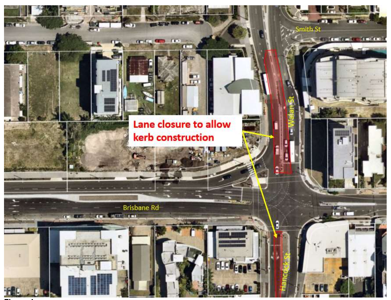
Figure 1. Walan Street - Concrete median construction area with partial lane closure. Hancock Street - Partial lane closure for traffic movement purposes only. Temporary changes to traffic conditions Monday to Friday only. All works are weather dependent.