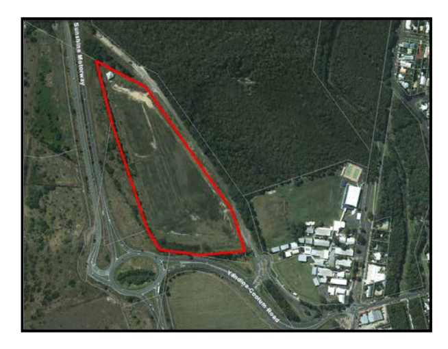
Figure 4: Location of Barns Lane Land

The majority of submissions received in relation to the land at Barns Lane, (including 74 Pro-forma submissions and 9 individual submissions) expressed support for the proposed rural zoning of the land between Barns Lane and the Sunshine Motorway as well as its exclusion from the Urban Growth Management Boundary. Two submissions were received from the land owner and one from a potential commercial tennant, which requested that the land be included in the Urban growth management boundary and to be future commercial considered for development.