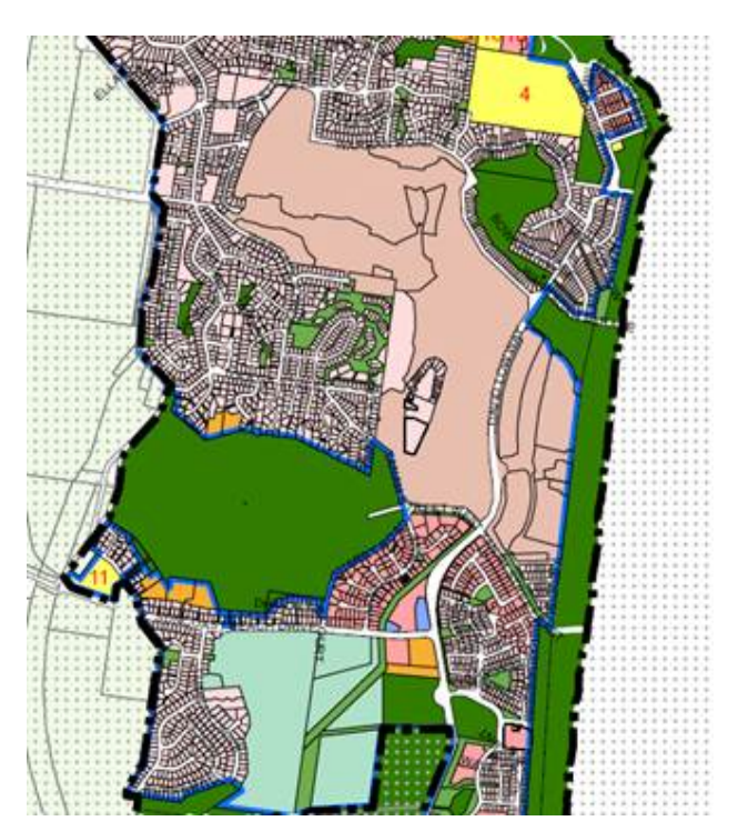
Figure 10: Extract from Draft Planning Scheme Zoning Map

Under the draft planning scheme, the Palmer Coolum Resort and Coolum Residences sites are included predominantly in the Emerging community zone, except for the existing residential developed areas which are included in the Low density residential zone and the parabolic dune area which is included in the Environmental management and conservation zone (see Figure 10 below).