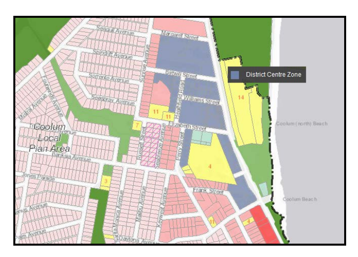
Figure 9: Draft Planning Scheme Zoning