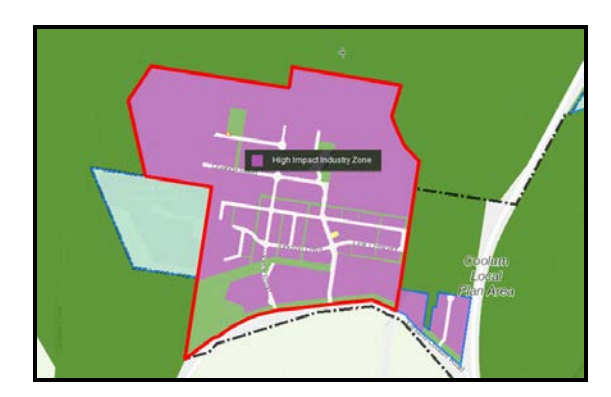
Figure 3: Height (Overlay Map OVM 30I)