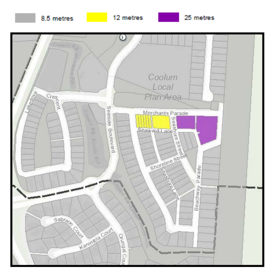
Figure 7: Draft Planning Scheme Height - Town of Seaside

A number of submissions objected to the 25 metre height limit and outlined that the maximum height limits should reflect the approved Master Plan.