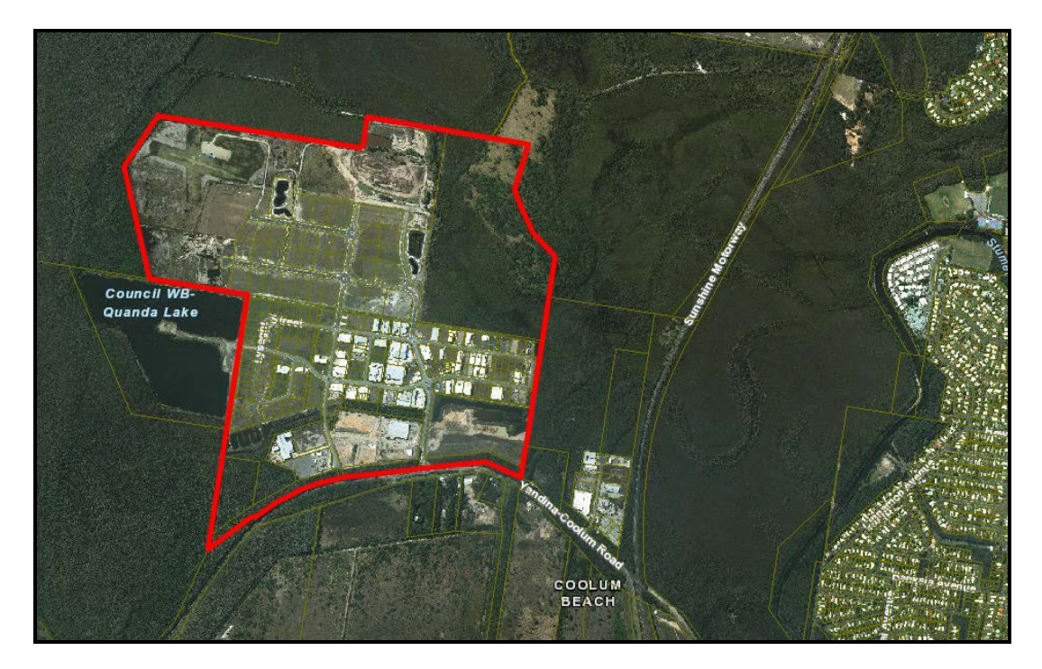
Figure 1: Coolum Industrial Park

The Coolum form letters and a number of individual submissions expressed opposition to the proposed High impact industry zone and maximum height of 20 metres for the Coolum Industrial Park on the basis that the proposed zoning is incompatible with existing operations, the potential impacts on the tourism of the local area and traffic impacts on the Yandina-Coolum Road.