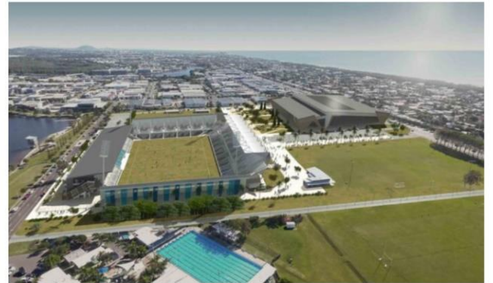
There are plans for new indoor sports centre and upgraded stadium at Kawana.

BY SUNSHINE COAST NEWS / 1 FEBRUARY 2023