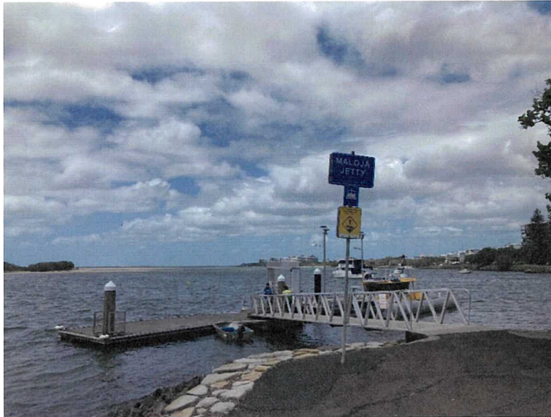
Figure 1: Existing pontoon