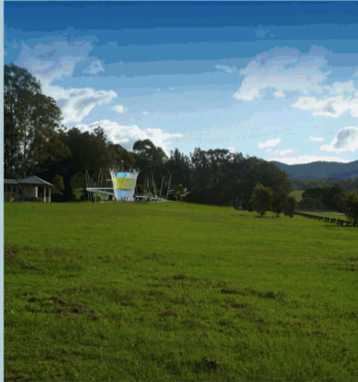
Montage looking West