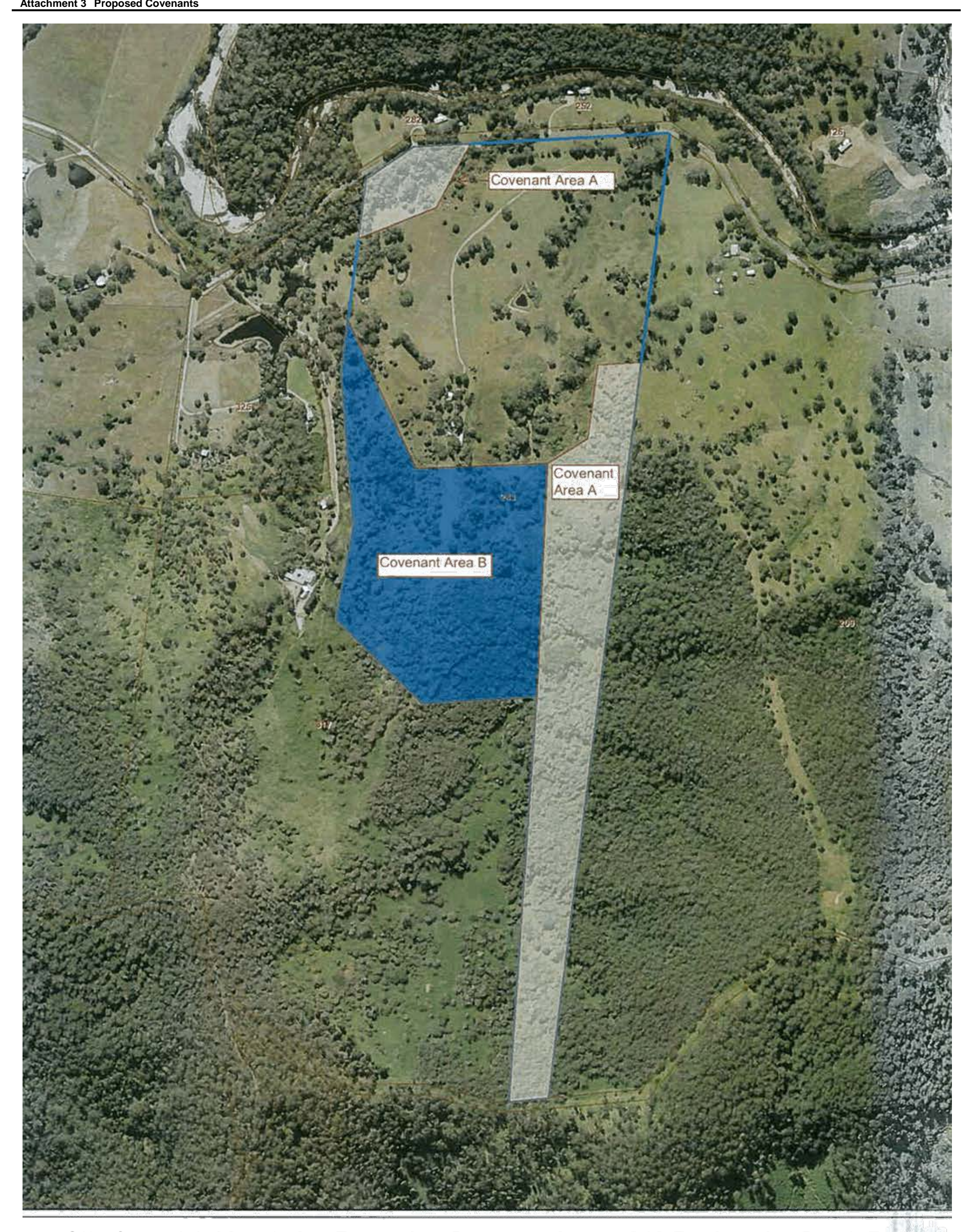
Attachment 1 - Vegetation Protection Covenant Areas; 243 Booloumba Creek Road