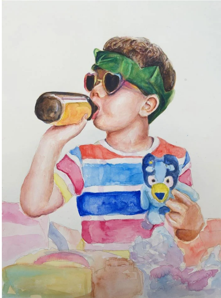
Kristine FORREST | Tides and Tinsel | 2023 | watercolour on Aquarelle paper | 24 x 32cm | Image courtesy of the artist