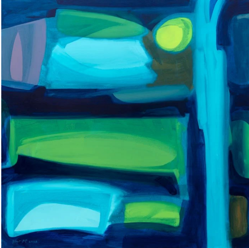
Blair MCNAMARA | Boreen Point #1 | 2023 | acrylic on canvas | 120 x 120cm