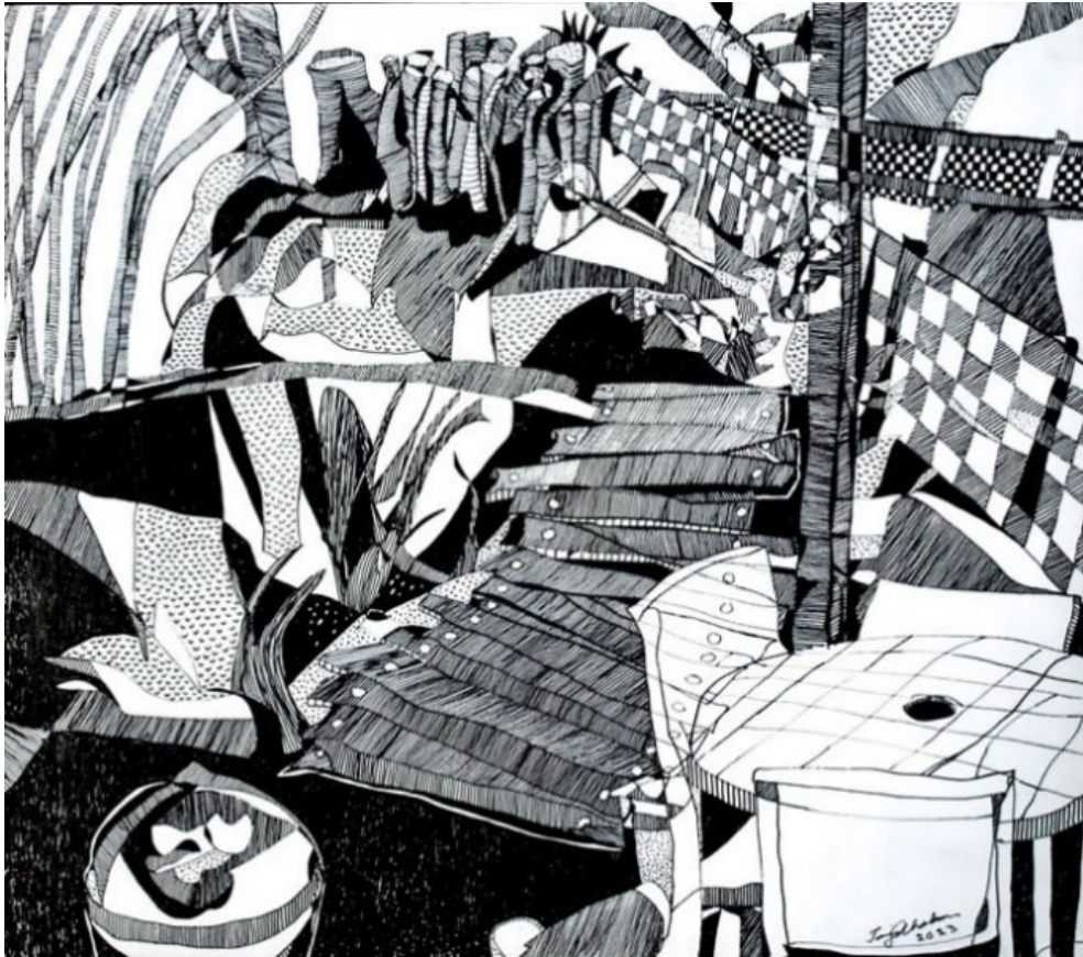
Tarja AHOKAS | Thaora Bridge | 2023 | ink pen on art board | 35 x 40cm