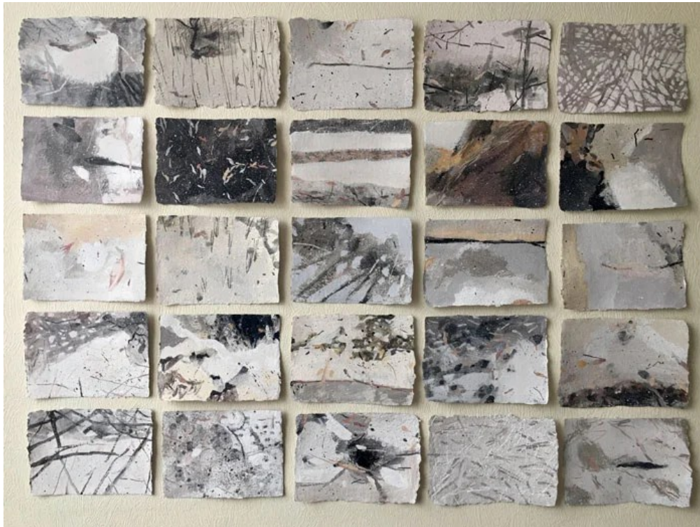
Laura VECMANE | Postcards from Lake Cootharaba | 2024 | chalk paint and wax on handmade paper | 85 x 110cm | Image courtesy of the artist