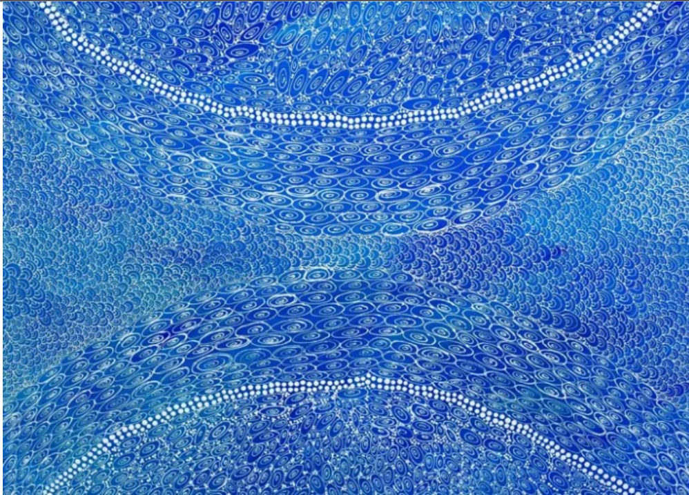
Zartisha DAVIS | The First Middens | 2023 | acrylic on canvas | 114 x 82cm | Image courtesy of the artist | Photo by James Muller