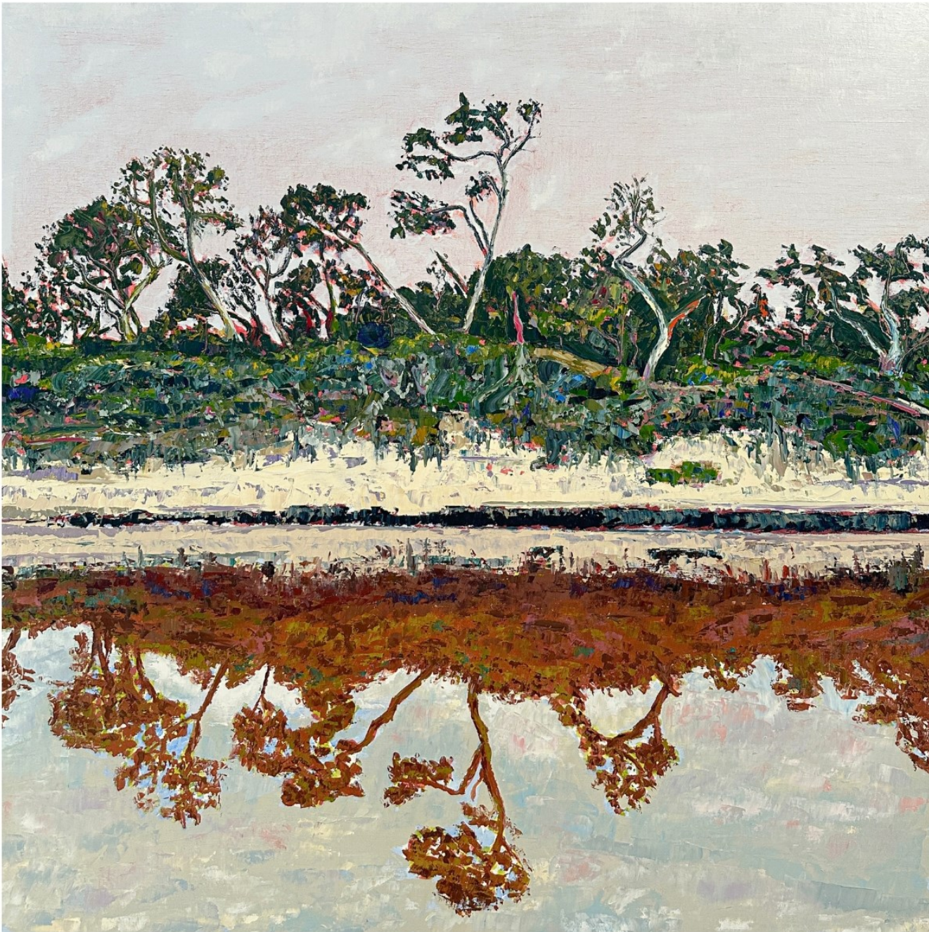
Image: Benjamin Hedstrom | Creek Reflection I (Coolum) (detail) | 2023 | oil on linen | 101 x 101cm | Winner, Best of Show, Local Artist – Local Content Art Prize 2023