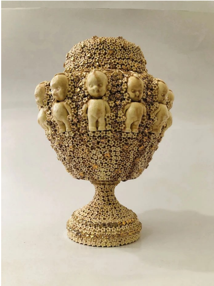
Julia HEGARTY | Pink Addiction | 2023 | mid fired glazed ceramics, amethyst pooling glaze, gold lustre | 38 x 27cm | Image courtesy of the artist