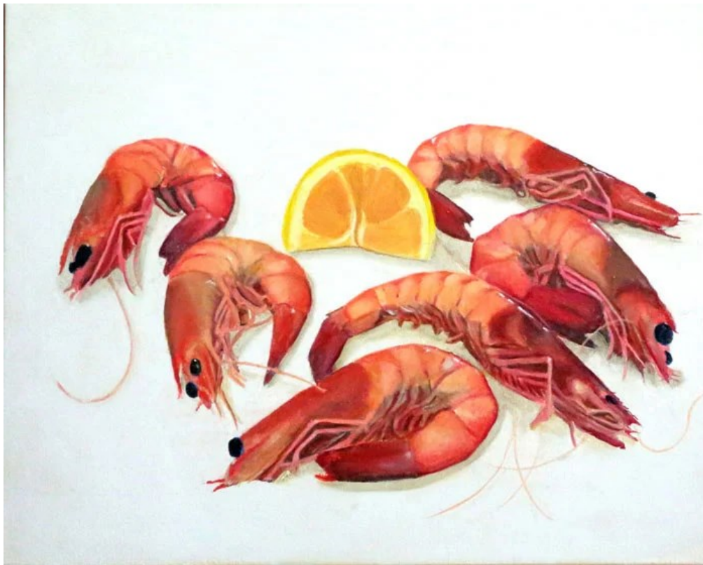
Robert STEVENS | Tickled Pink | 2022 | oil on canvas | 33 x 43cm | Image courtesy of the artist