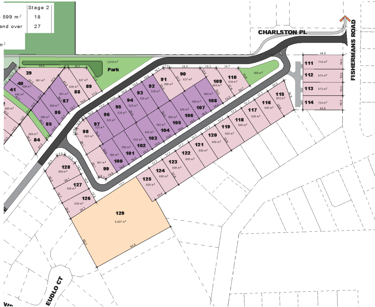
Dimensioned Lot Plan