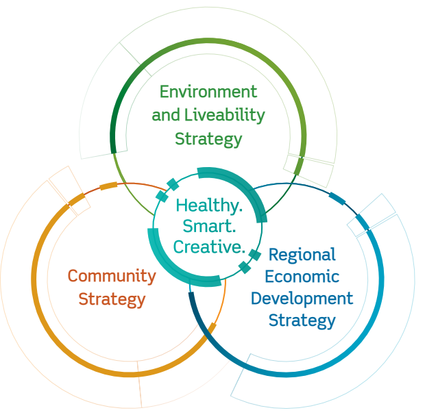
Council's regional strategies to deliver on our vision

The unique values and rich diversity of the Sunshine Coast make it a truly special place where environmental, social and economic priorities have been carefully balanced so it is recognised as Australia's most sustainable region – Healthy. Smart. Creative.