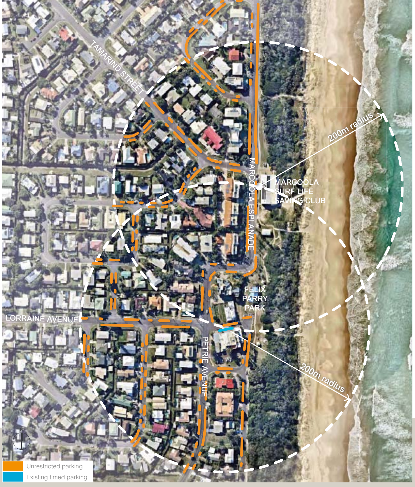
Marcoola parking focus areas

The area is known to become busy, particularly on weekends and for community events around the Felix Parry Park and Lorraine Avenue. The current supply of parking together with accepting parking occurring in surrounding streets is considered to be sufficient to cater to the typical parking demands.