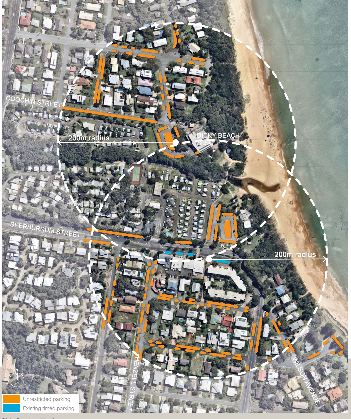
Dicky Beach parking focus areas

Dicky Beach is known to have a variable parking demand across the year and becomes busy particularly on weekends and peak holiday periods. The current supply of parking together with spillover parking in adjacent streets is considered to cater to the typical demand.