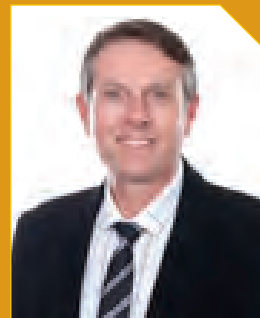
Director Infrastructure Services