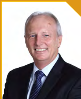
Director Corporate Services