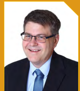
Director Planning and Environment