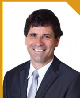
Director Economic Development and Major Projects