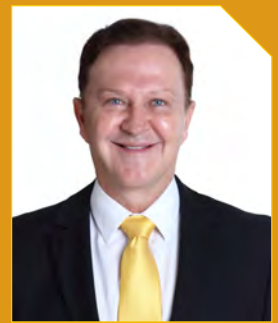
Chief Executive Officer Commenced 21 September 2015

The Chief Executive Officer and five Directors make up council's Executive Leadership Team. This team has the shared responsibility for providing the organisation with leadership and direction to achieve the outcomes determined by council.