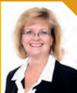
Director Community Services