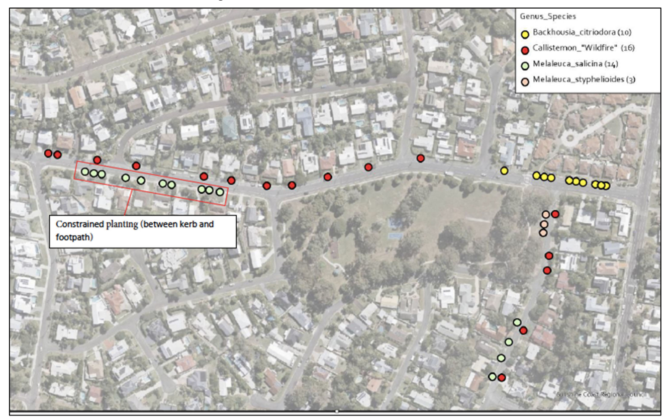
Figure 2: Storm Watered Street Tree Locations