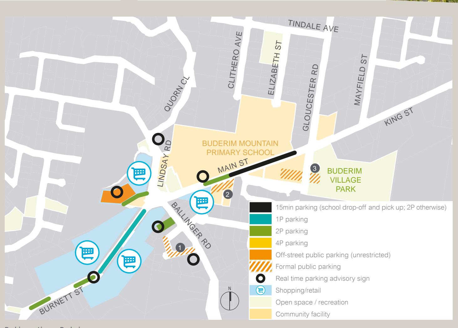
Parking actions - Buderim

• Investigate options for additional parking using the northern public offstreet car parking accessed off Lindsay Road.