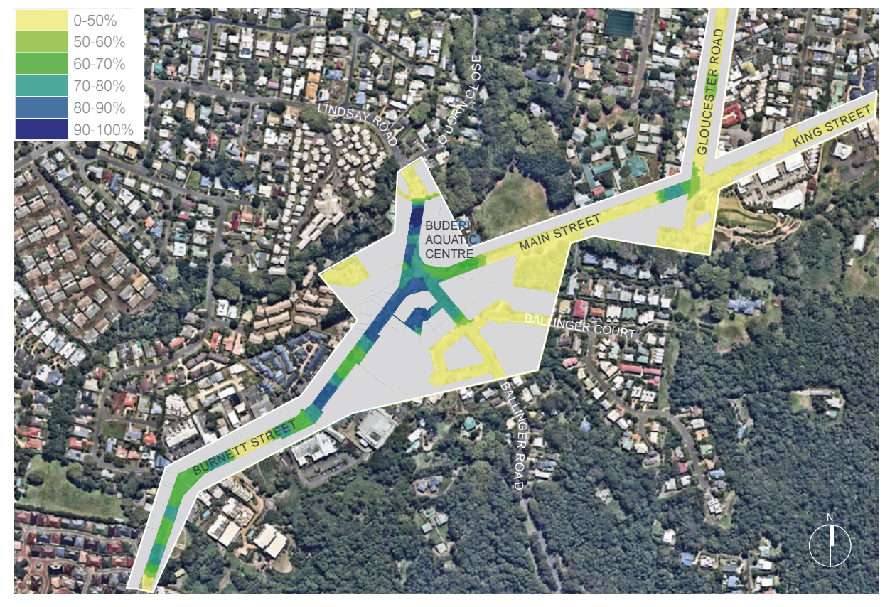
Weekday parking occupancy (typical peak)