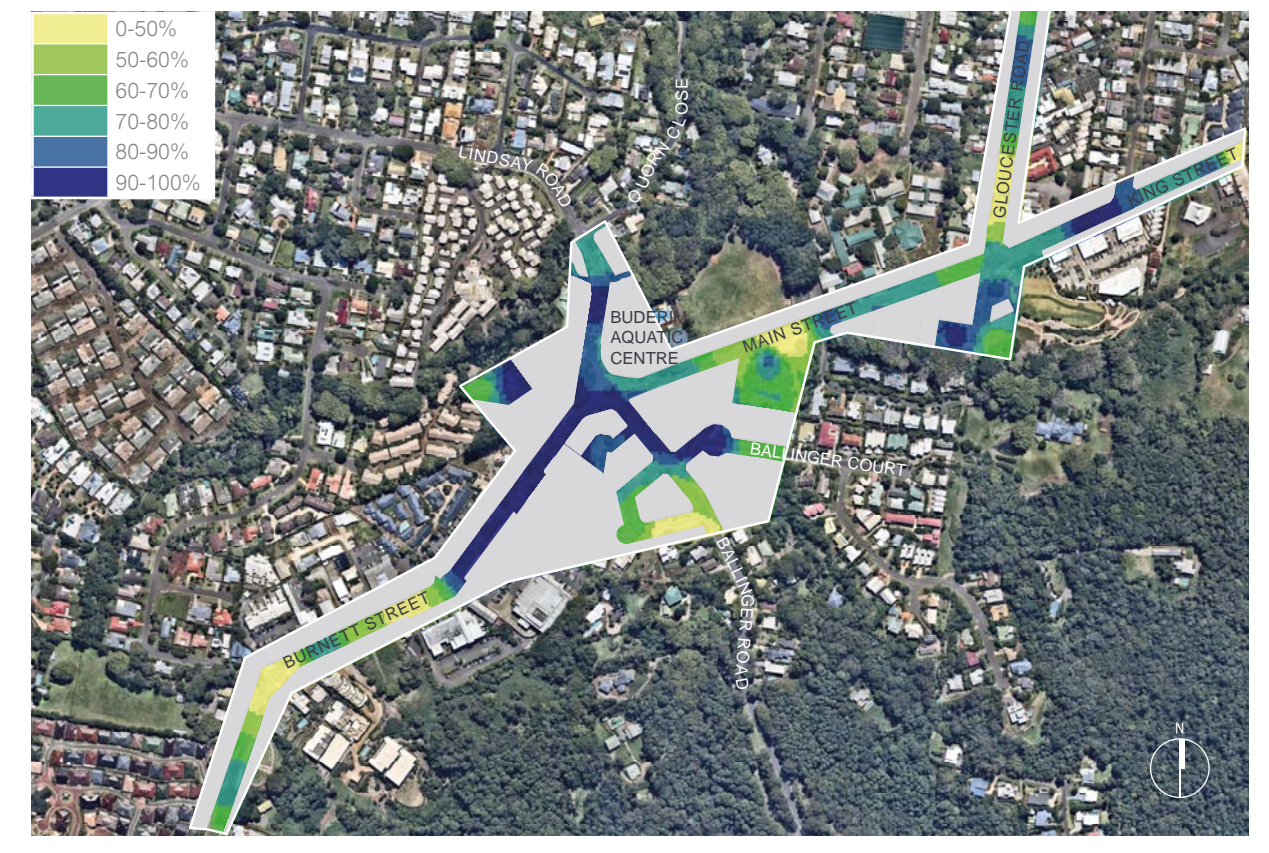
Weekend parking occupancy (typical peak)