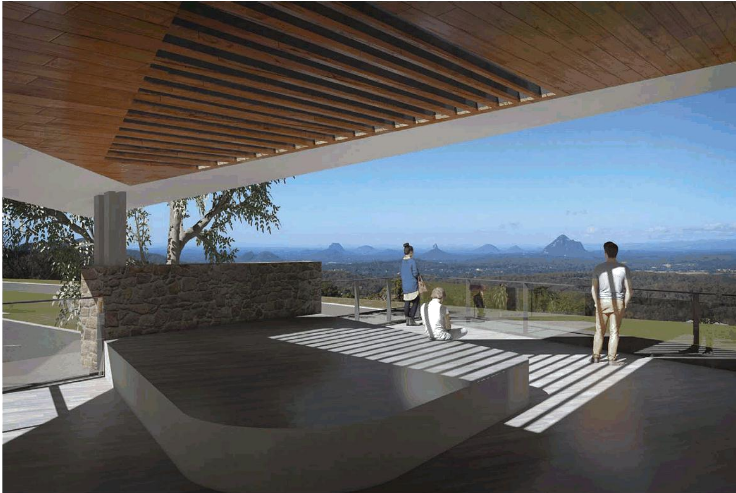
VIEW 2E - FROM VIEWING PLATFORM