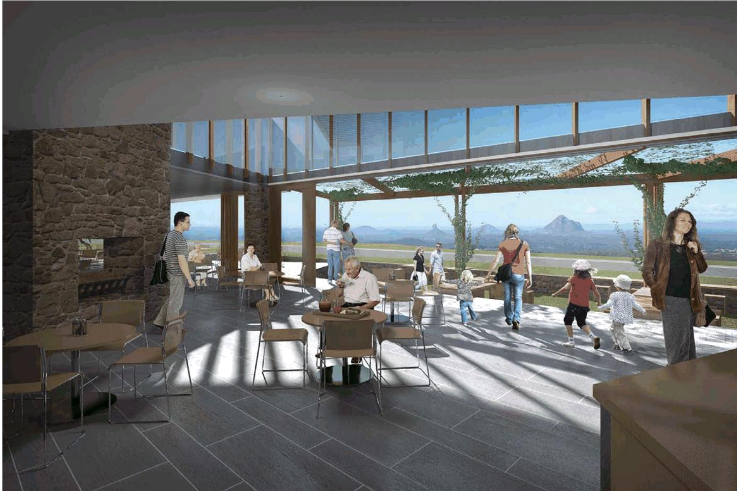
VIEW 2F - FROM CAFE INTERIOR