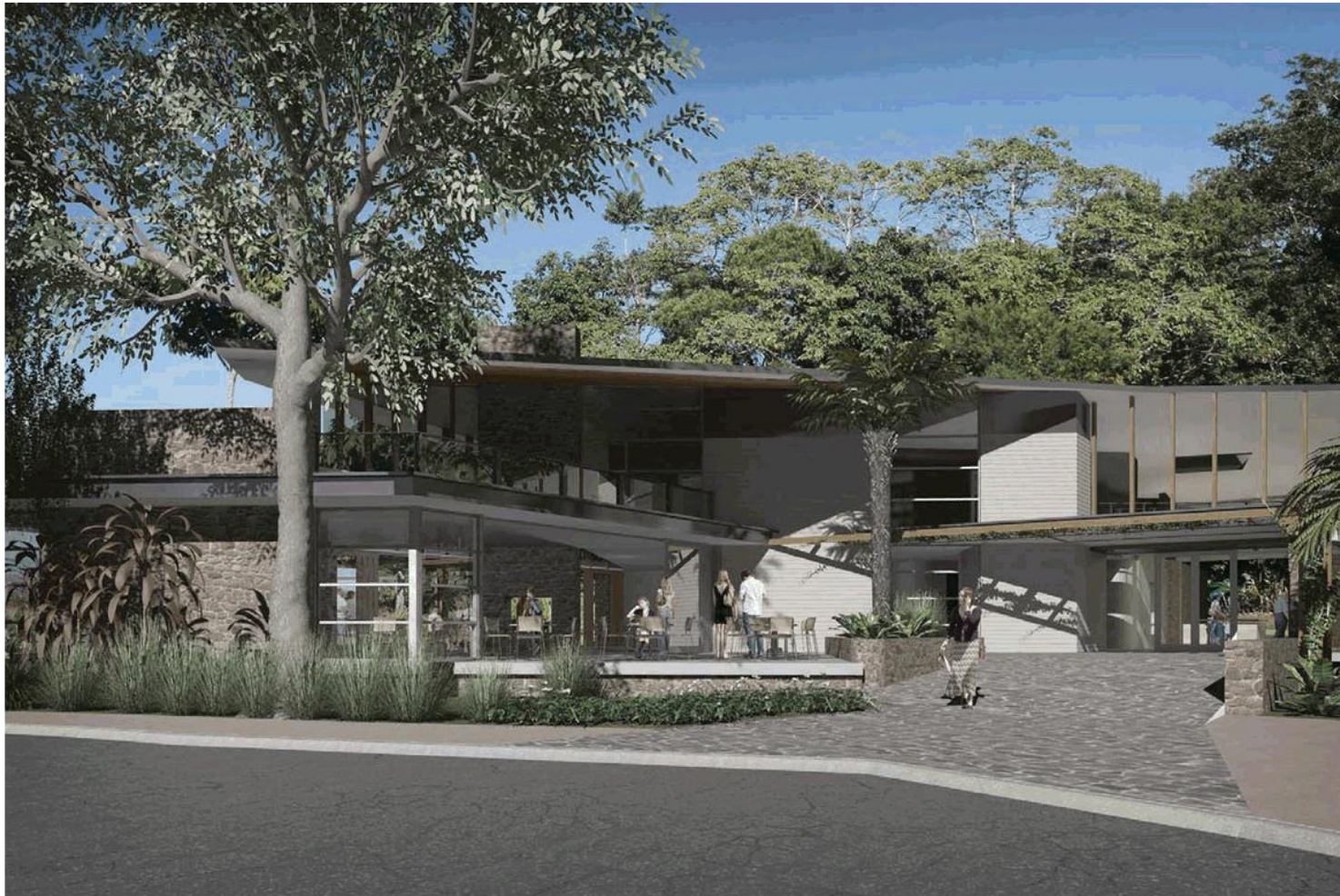
VIEW 2C - FROM ENTRY