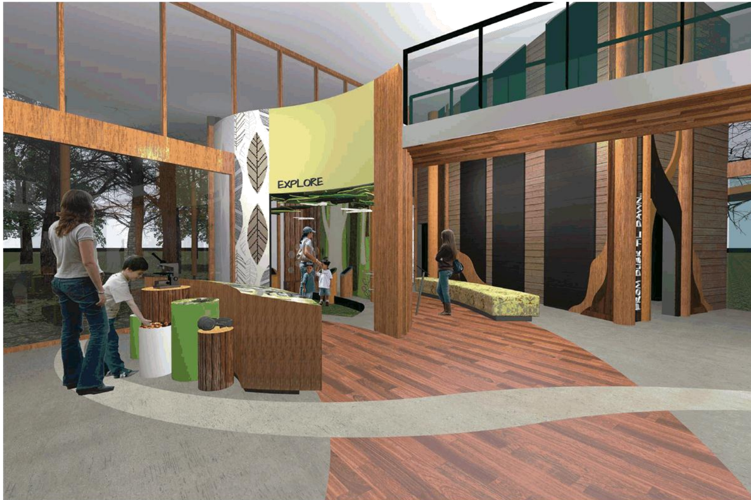
CONCEPT 2 - VIEW TO KIDS AREA & NIGHT ZONE

FOCUS PRODUCTIONS EXHIBITIONS DISPLAYS ENVIRONMENTS