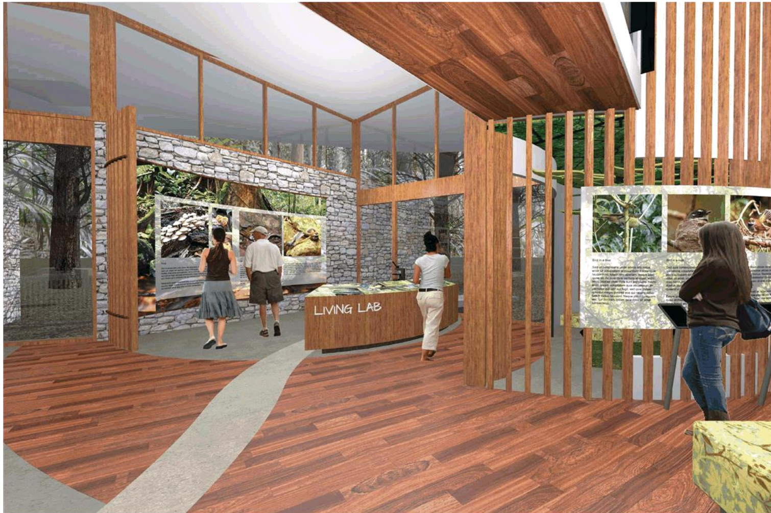
CONCEPT 2 - VIEW TO THE "LIVING RAINFOREST"

FOCUS PRODUCTIONS EXHIBITIONS DISPLAYS ENVIRONMENTS