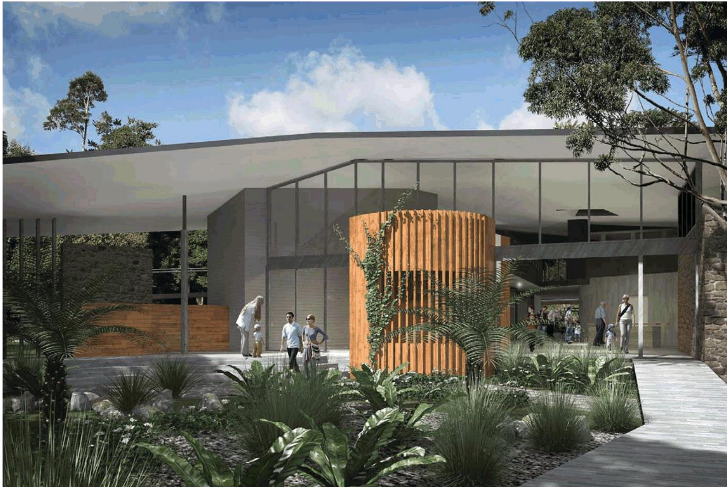
VIEW 2D - FROM OUTDOOR INTERPRETATIVE ZONE