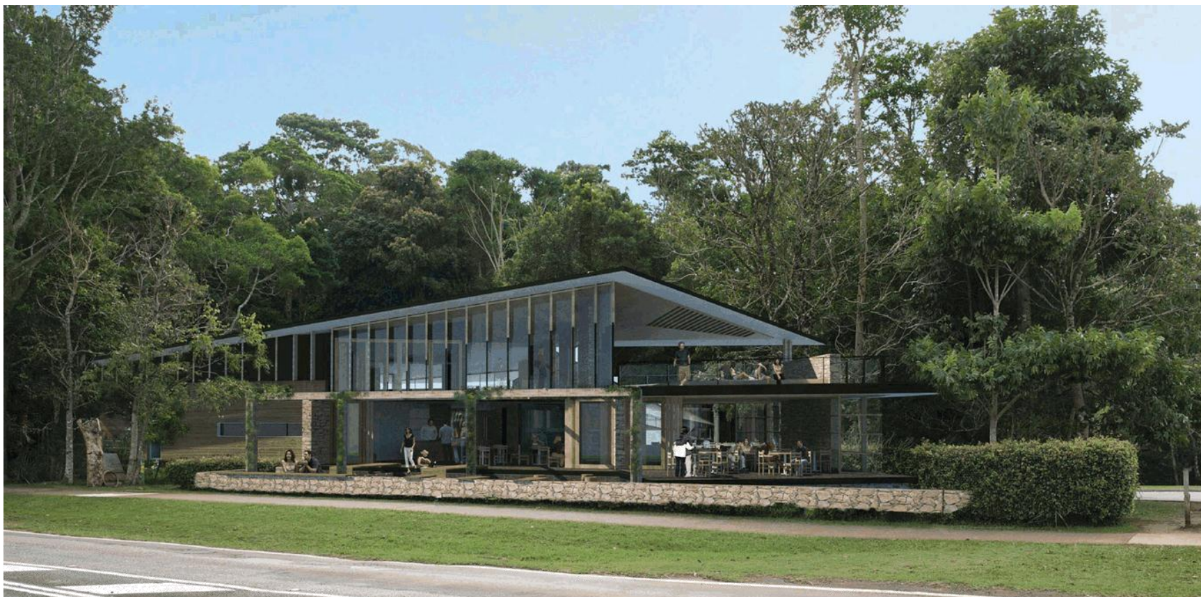
VIEW 2A - FROM MOUNTAIN VIEW ROAD