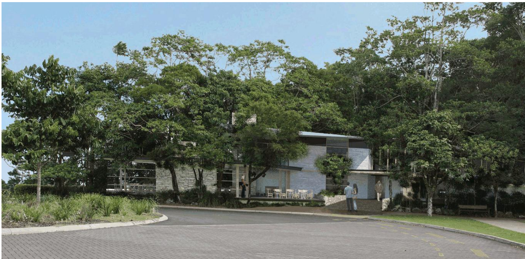
VIEW 2B - FROM EXISTING CAR PARK