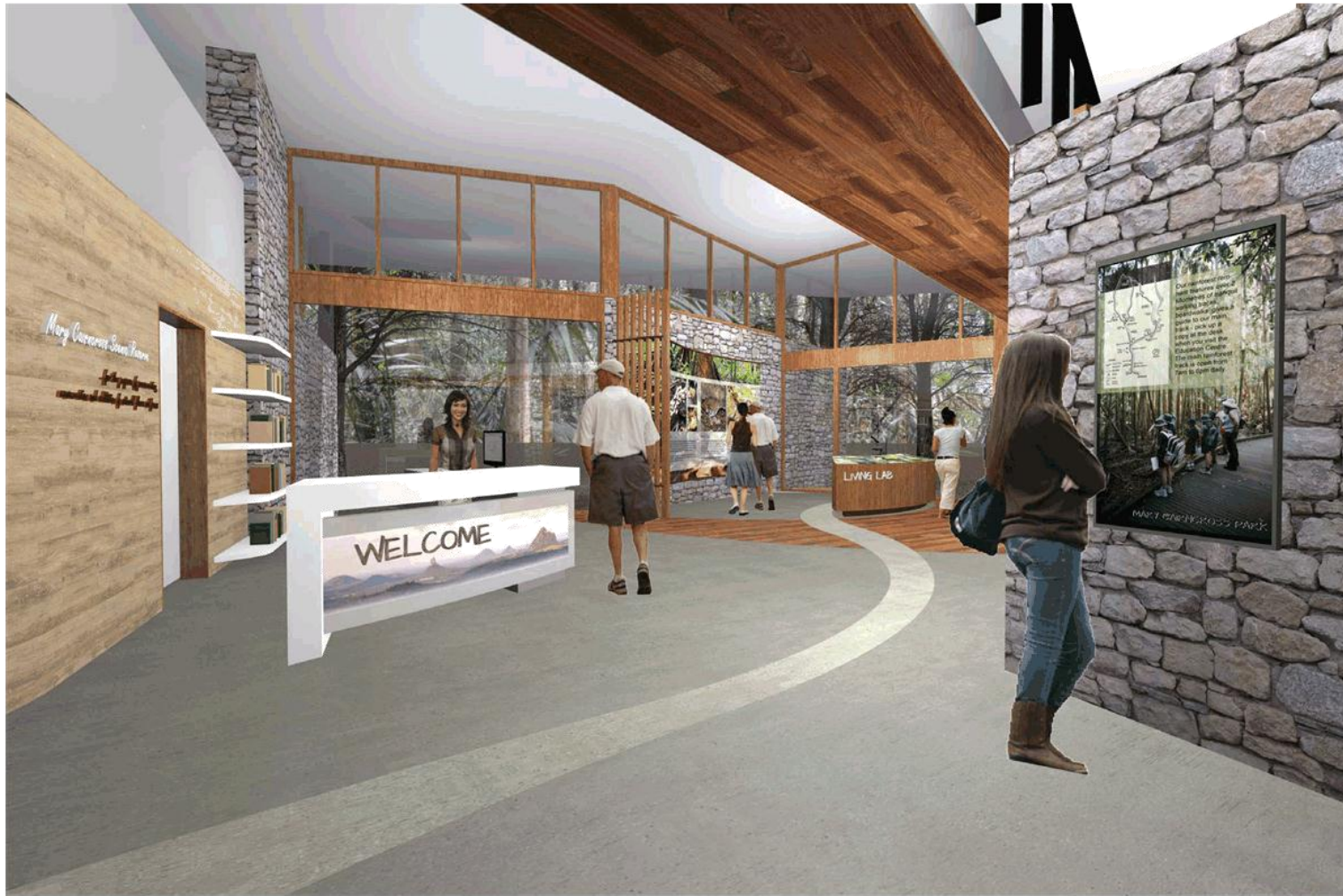
CONCEPT 2 - VIEW TO WELCOME DESK

FOCUS PRODUCTIONS EXHIBITIONS DISPLAYS ENVIRONMENTS