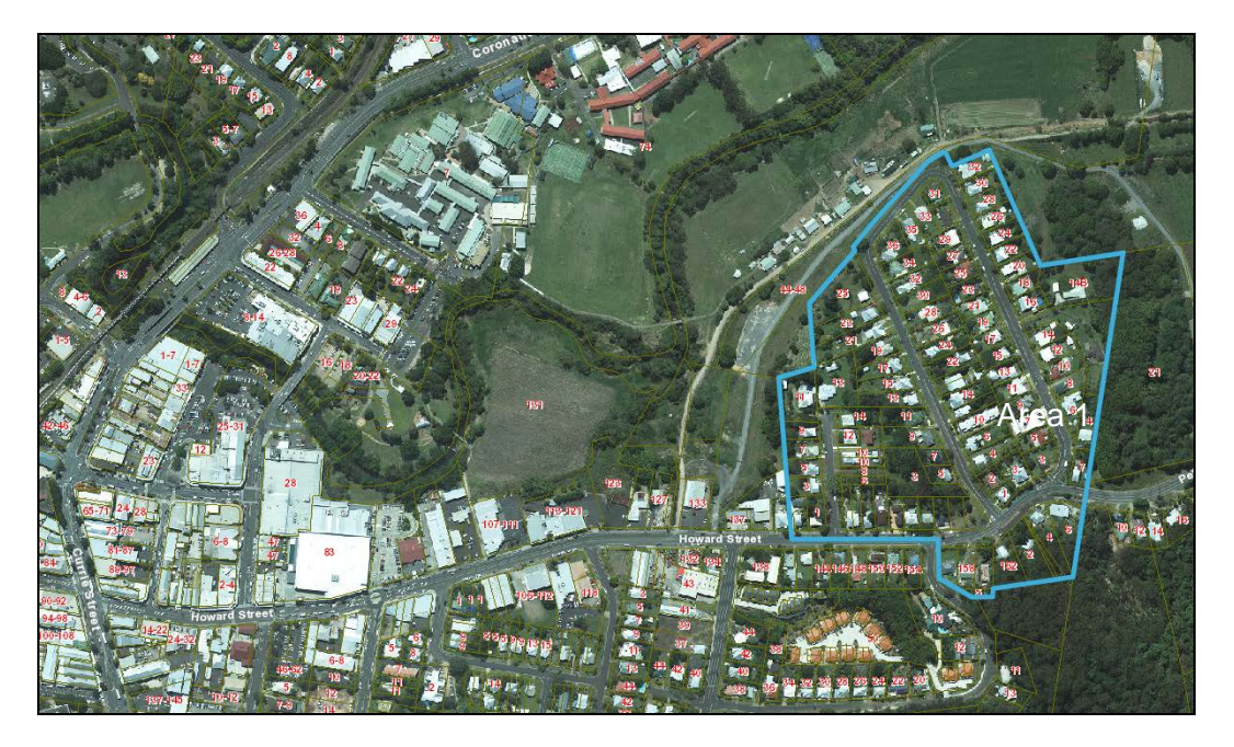
Figure 1: Area 1: Mount Pleasant Road/Fairmeadow Road/Archie Street Area

A number of these buildings (or complexes of buildings) contain dual occupancies or multiple dwelling units.