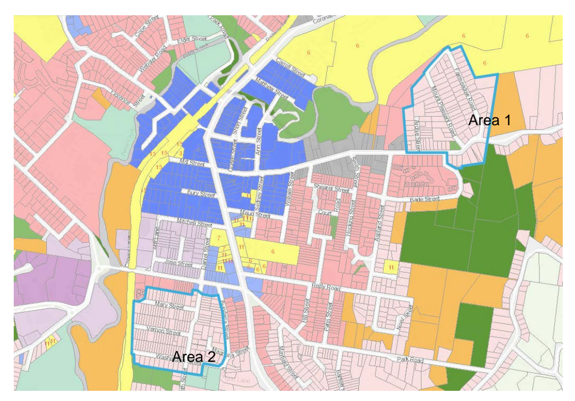
Figure 4: Extract from Zone Map ZM37 for Nambour local plan area

Under the draft planning scheme, both areas are proposed to be included in the Low density residential zone (refer Figure 4 ).