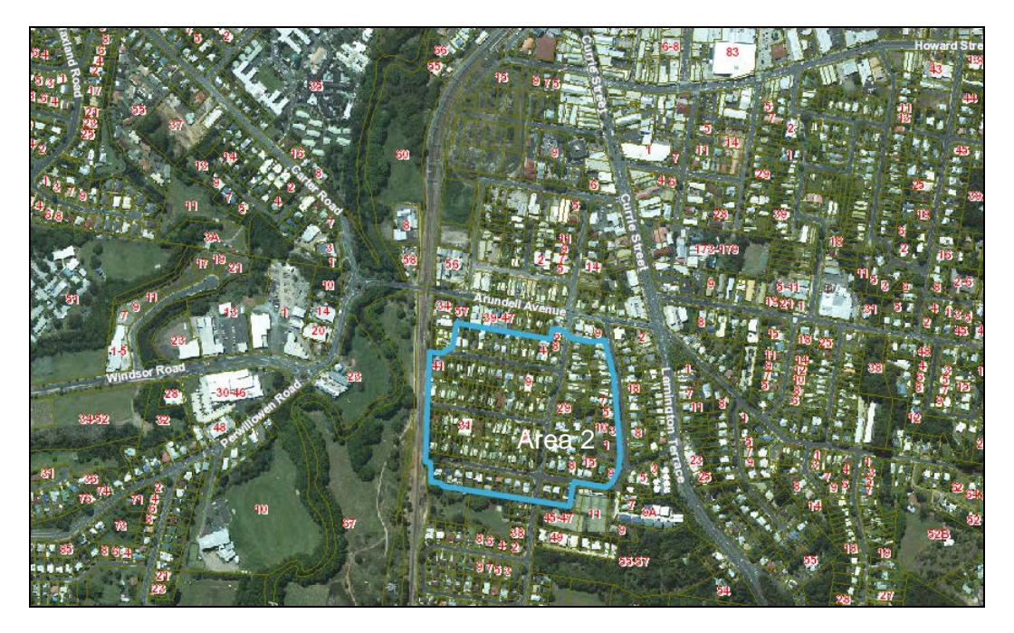
Figure 2: Area 2: Mary Street/Vernon Street/Washington Street Area