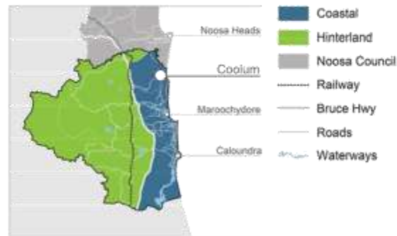
Figure 1: Context Map