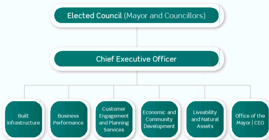
Figure 2: Organisational Structure

This joint approach, for which the Sunshine Coast is renowned, enables consistent, focused, timely and value for money services being delivered to our community. Operational activities are also incorporated into Group and branch business plans, as well as individual performance plans. Each Group is responsible for managing the scheduling, delivery, performance and reporting for those activities, projects and services for which they have lead responsibility in line with the commitments and expectations of Council, as well as identifying, managing and monitoring operational risks.