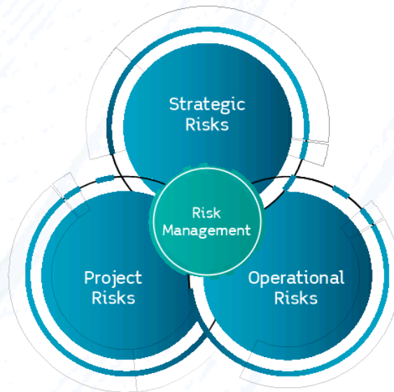
Figure 4: Risk Management

Council regularly reviews, monitors and reports on risks across Council, including strategic risks, operational risks and project risks. This enables Council to continue to adapt and deliver quality services to the community through its operational plan.