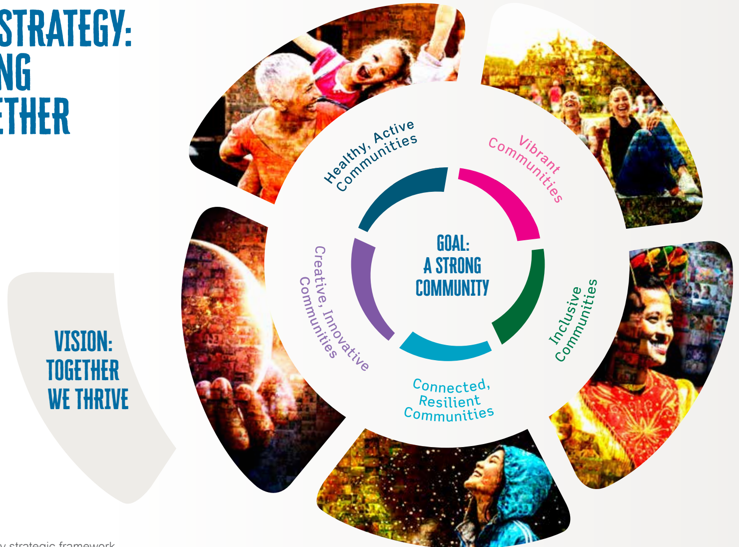
Chart 2: Sunshine Coast Community Strategy strategic framework