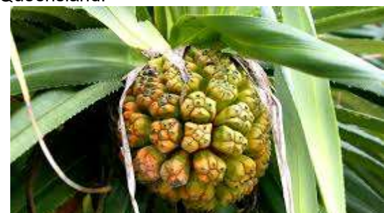
Figure 1 Pandanus Tree Fruit inspiration

In designing the towers, specialist companies Place Design Group and Fleetwood Urban have drawn inspiration from the shapes and colours of nature - specifically the segmented fruit of the iconic Pandanus Tree which is native to coastal Queensland.