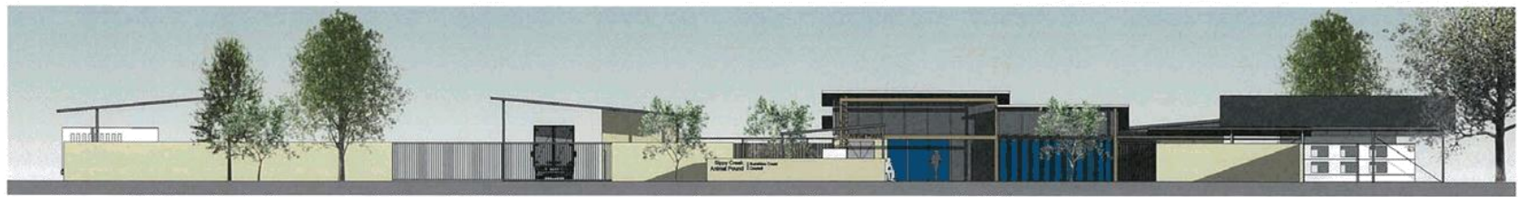
1 Scheme A - South Elevation 1:100