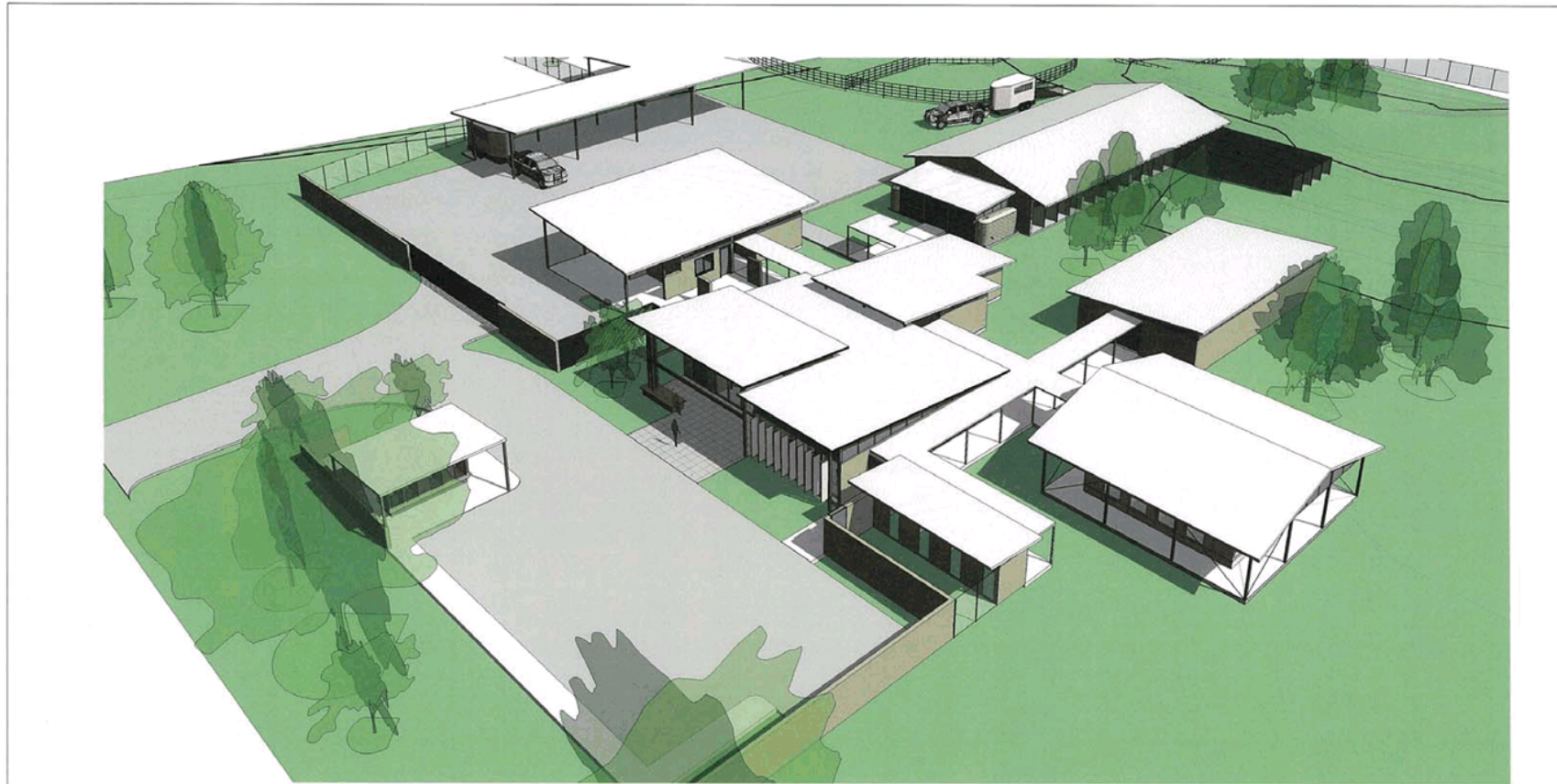
1 Scheme A - Aerial Perspective