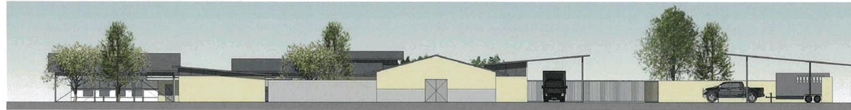
2 Scheme A - North Elevation 1:100