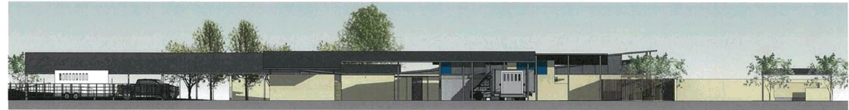
3 Scheme A - West Elevation 1:100