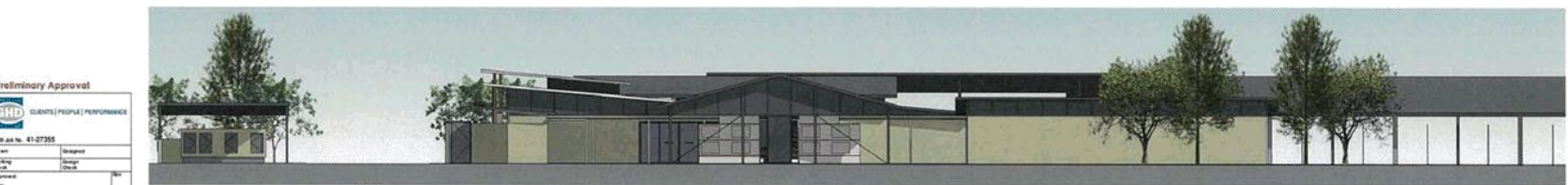
4 Scheme A - East Elevation 1:100