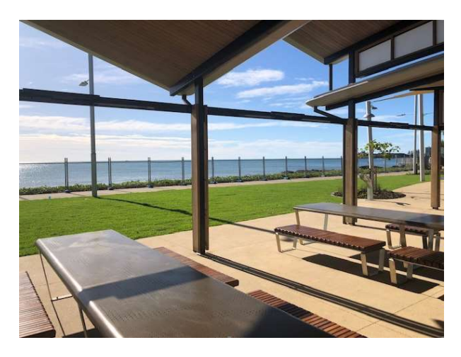
Figure 2 View from new barbecue shelter