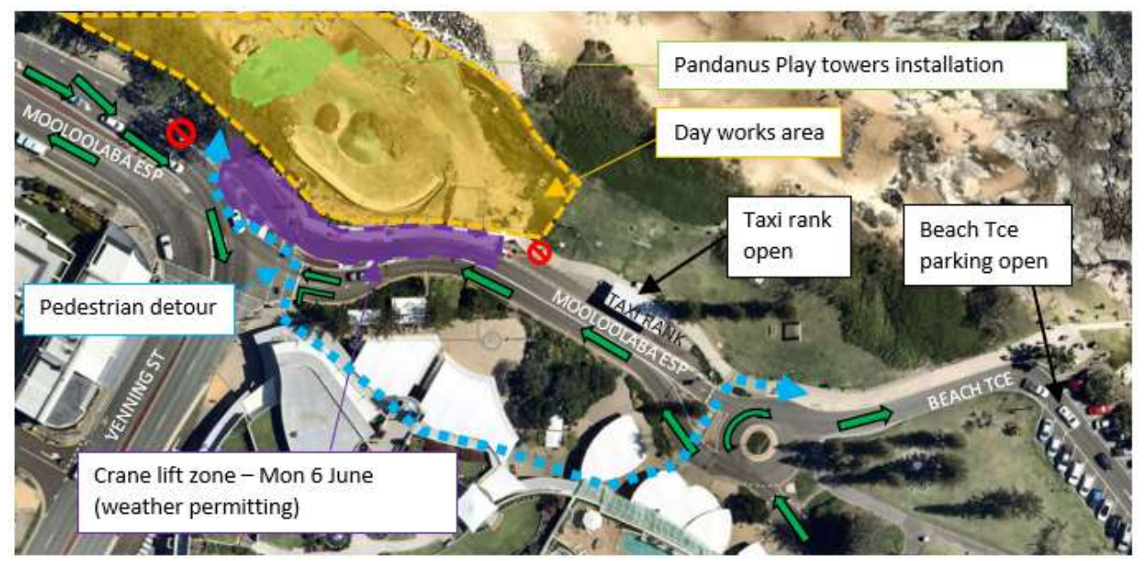
Figure 3 Map of temporary changes to traffic conditions for crane on Monday 6 June