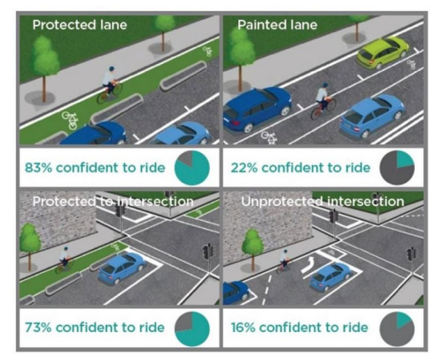
Figure 1 Riding confidence

The project will create a low stress bike riding experience. Research* shows that a separated cycle track (with concrete between the lane and vehicle traffic) provides new and cautious cyclists with significantly more confidence (83%) when compared to a painted cycle lane (22%). Refer Figure 1.