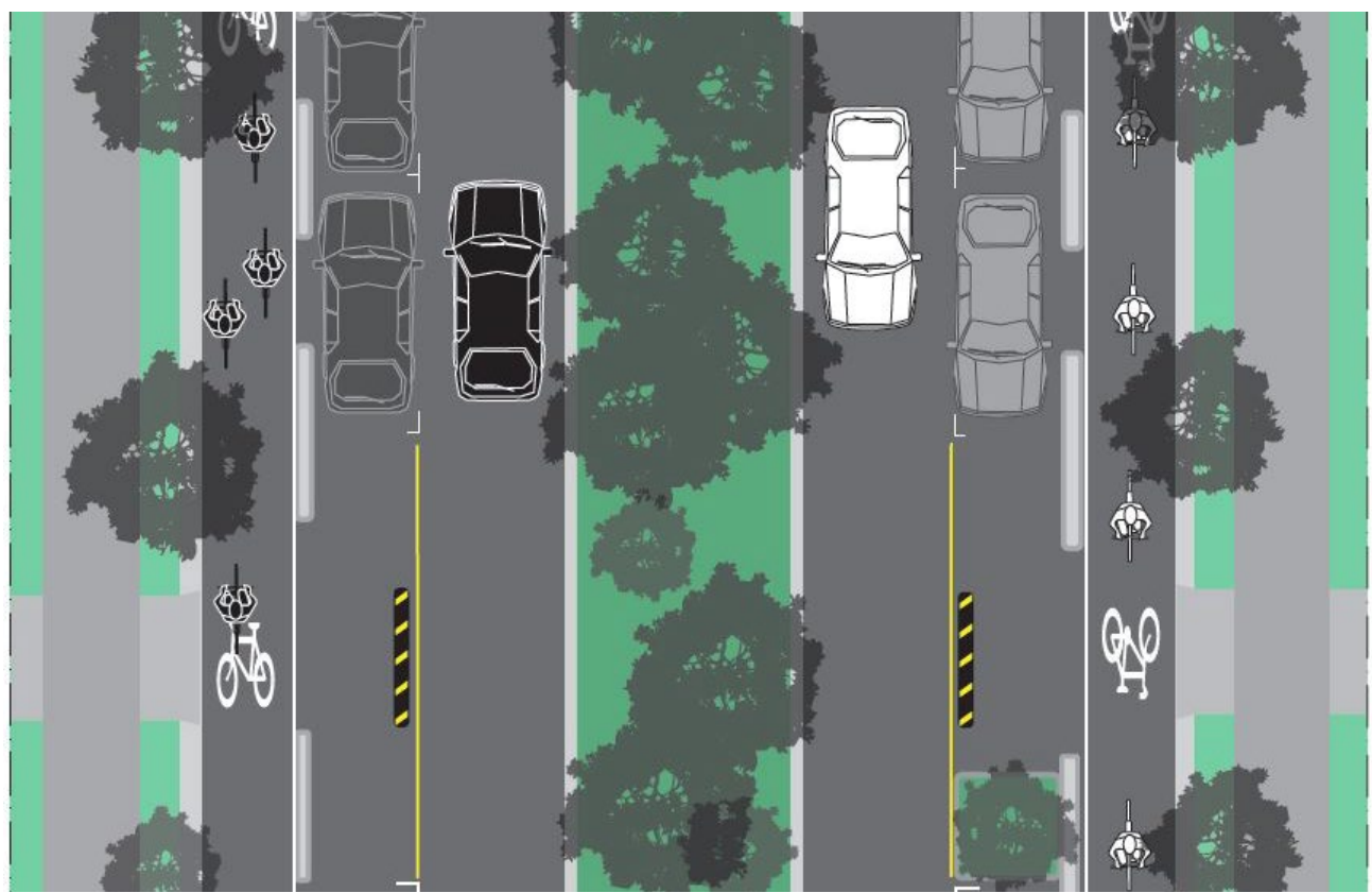
Figure 4 Our community's preferred option for the cycle track, Option 2 (indicative only).