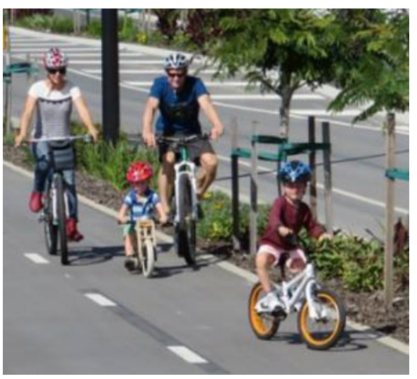
Figure 3 Low stress separated cycle track