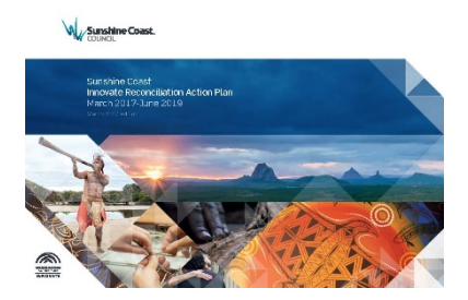
First Nations Procurement Guideline