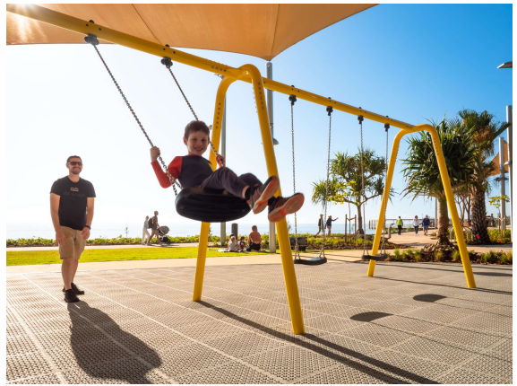
Figure 1 – locals and visitors enjoying the new Northern Parkland

Please continue to support local businesses during construction.