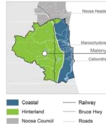
Figure 1: Context Map