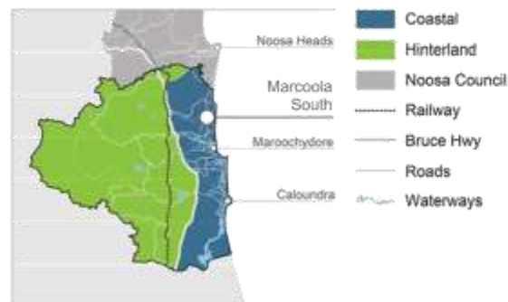
Figure 1: Context Map