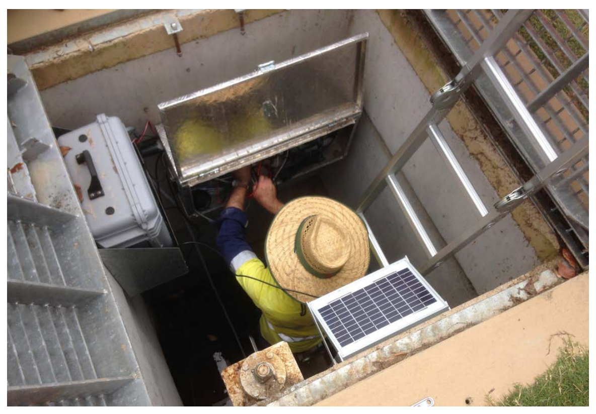
Figure 3 – Installation of Automated Water Sampling Equipment in Diversion Pit

Internet-enabled telemetry equipment was used to notify SWRG researchers when a rainfall event had occurred and water samples were ready for collection. The composite samples were then collected by an independent contractor within six hours of the end of the rainfall event and transported to a National Association of Testing Authority (NATA) water laboratory for analysis.