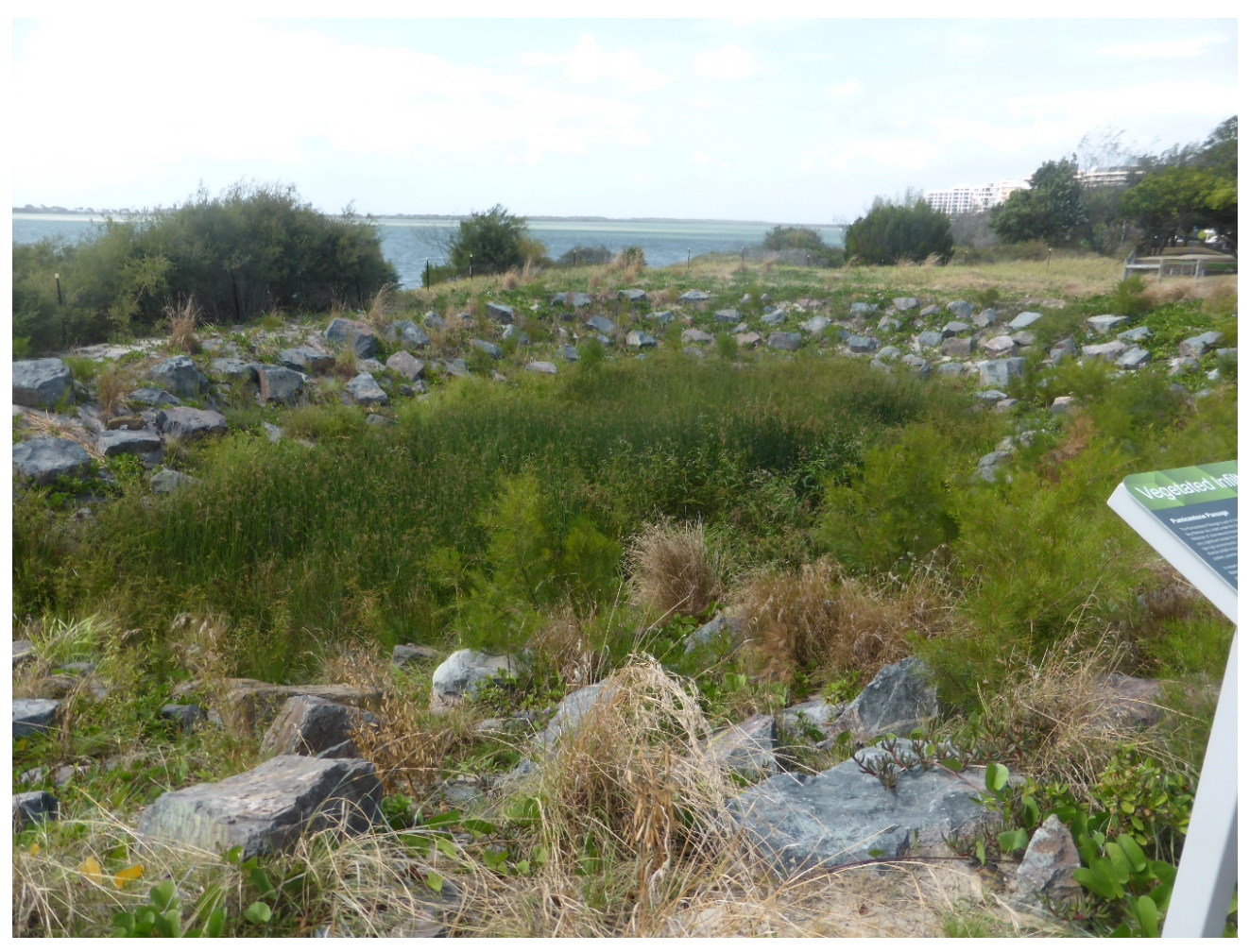
Figure 6 – Fully Established Vegetation in Earnshaw Street Infiltration Basin

This study of the Earnshaw Street Stormwater Vegetated Infiltration Basin at Golden Beach successfully met the specific objectives of the study which were to quantify the volumes of stormwater runoff treated by the vegetated infiltration basin, and to estimate the pollution removal performance of the basin. The study found that the basin removed an estimated 264 kg of TSS, 1.01 kg of TP and 9.97 kg of TN from runoff from rainfall events between 3-3-2017 and 21-10-2017 and prevented these significant pollutant loads from entering Pumicestone Passage. The basin is now fully established (Figure 6) and it can be expected that the pollution removal performance of the vegetated infiltration basin will improve even further in the future. This is a great result for Pumicestone Passage, for the local community, and for the Sunshine Coast Council.