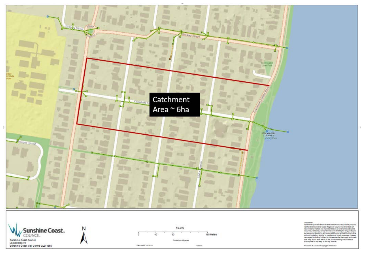
Figure 4 – Catchment area treated by Earnshaw Street Vegetated Infiltration Basin

The total volumes of stormwater being conveyed to the basin diversion pit by the main drainage line during storm events were calculated by multiplying the catchment area by the daily rainfall data from the BOM rain gauge at Caloundra Airport (www.bom.gov.au). A Runoff Coefficient (C) of 0.7 was applied to the volumes to allow for infiltration into the high-density urban residential catchment (QUDM, 2013 - Table 4.5.1). The rainfall catchment area for the Earnshaw Street stormwater outfall was estimated to be approximately 6.0ha (Figure 4 – SSC Stormwater Drainage Infrastructure Plan). Estimated runoff volumes are listed in Table 2.