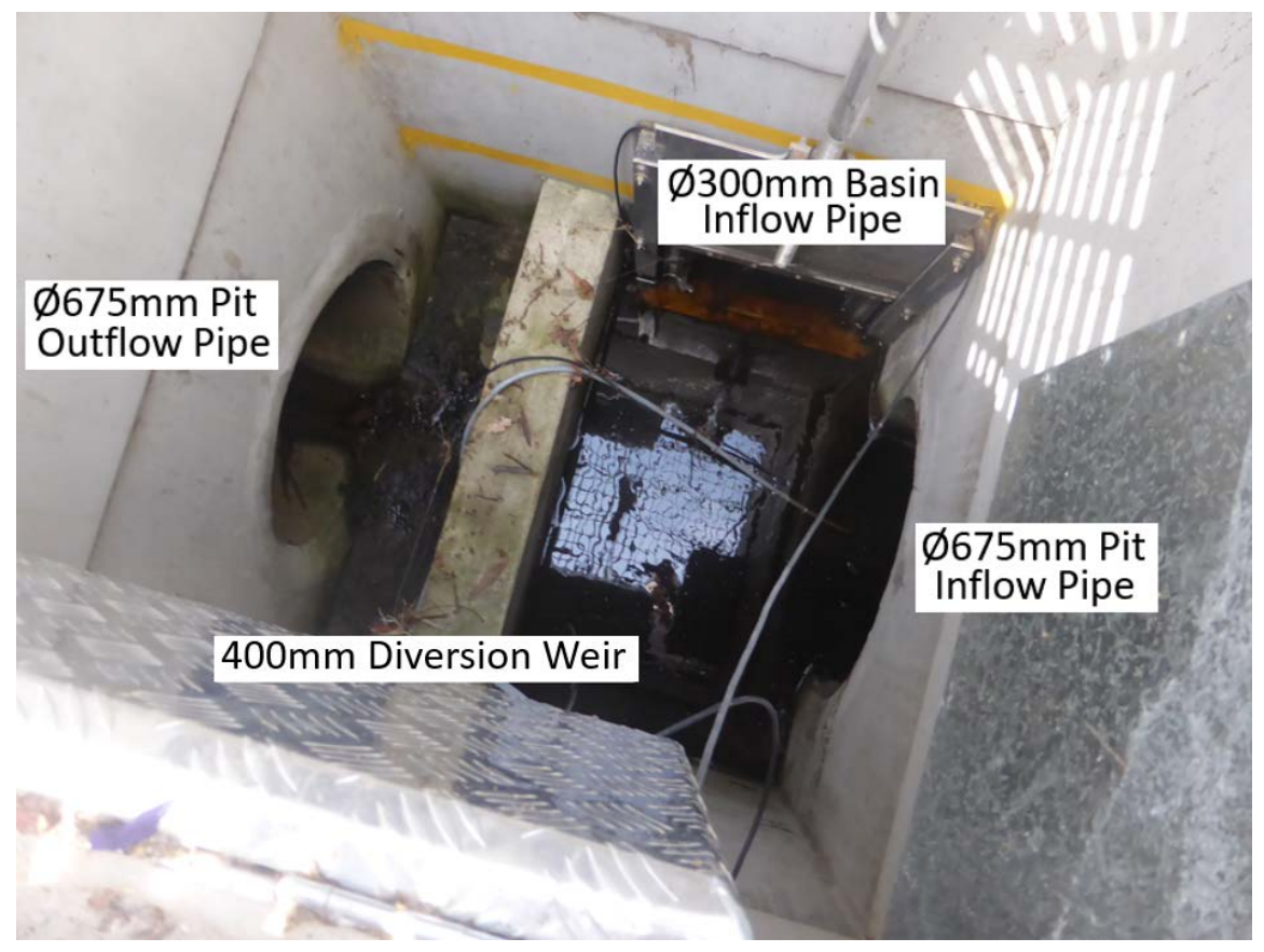
Figure 5 – Catchment area treated by Earnshaw Street Infiltration Basin