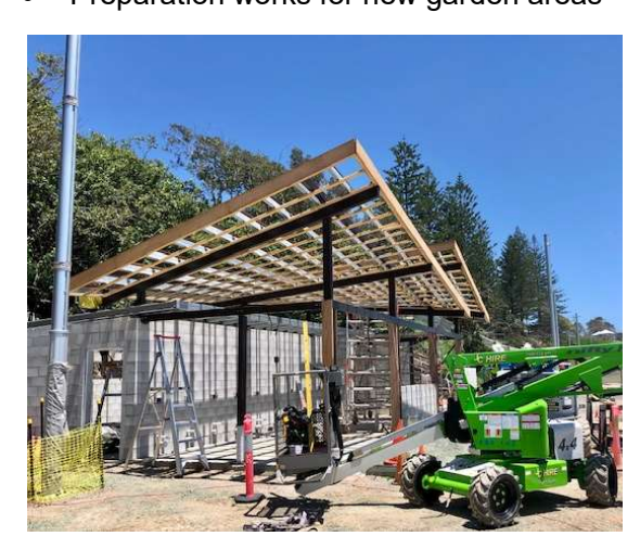
Figure 1 New amenities building under construction

All information contained in this communication is accurate at the time of distribution however works and dates are subject to change due to circumstances outside of Sunshine Coast Council's control.