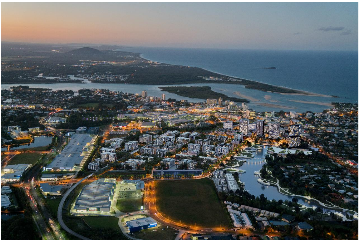
Image 1. Maroochydore City Centre project

As has always been the case, increased certainty around the delivery and timing of the new runway at the Sunshine Coast Airport will significantly aid the mission to secure commercial investment in the city centre.