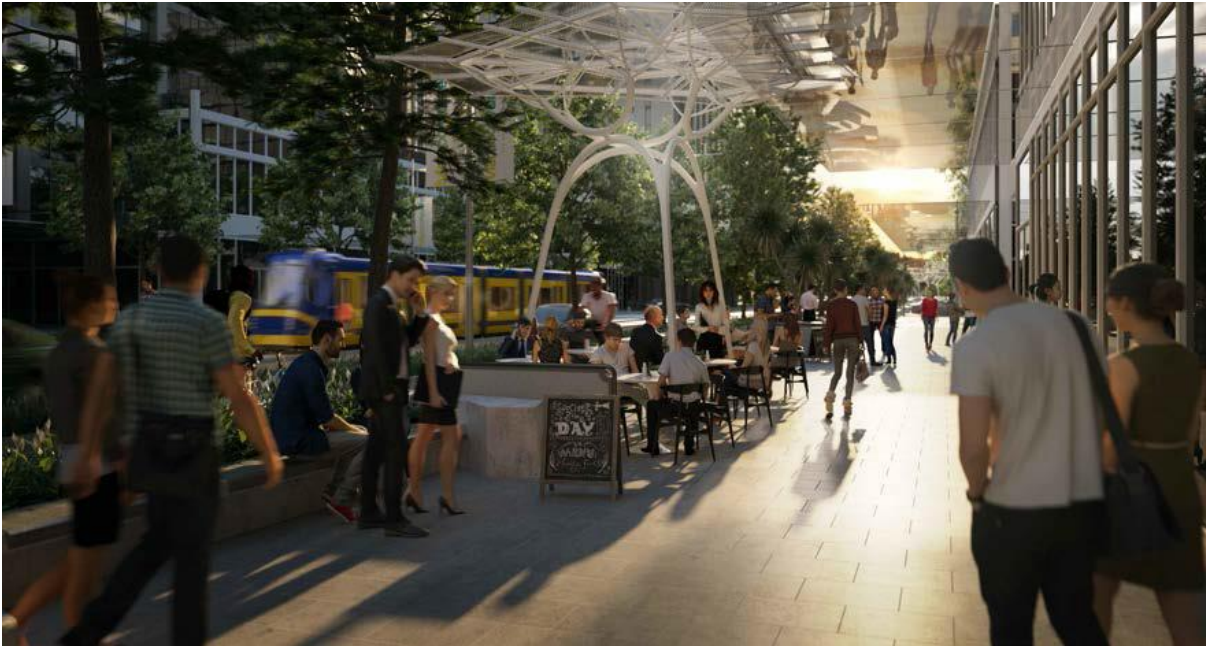
Image 2. Maroochydore City Centre project, Town Centre Boulevard