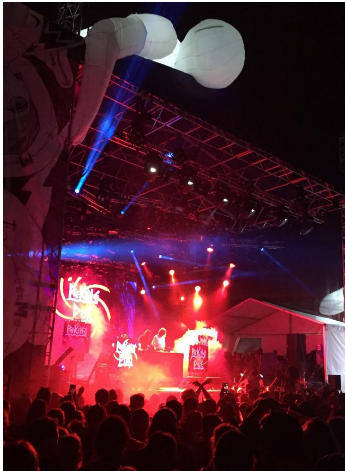
Image 6. Maroochy Music and Visual Arts Festival

The second MMVAF was held on site on 10 September 2016, with approximately 6,000 people in attendance. The event passed without incident and provided a good opportunity for organisers to further profile the arts and entertainment credentials of the region.