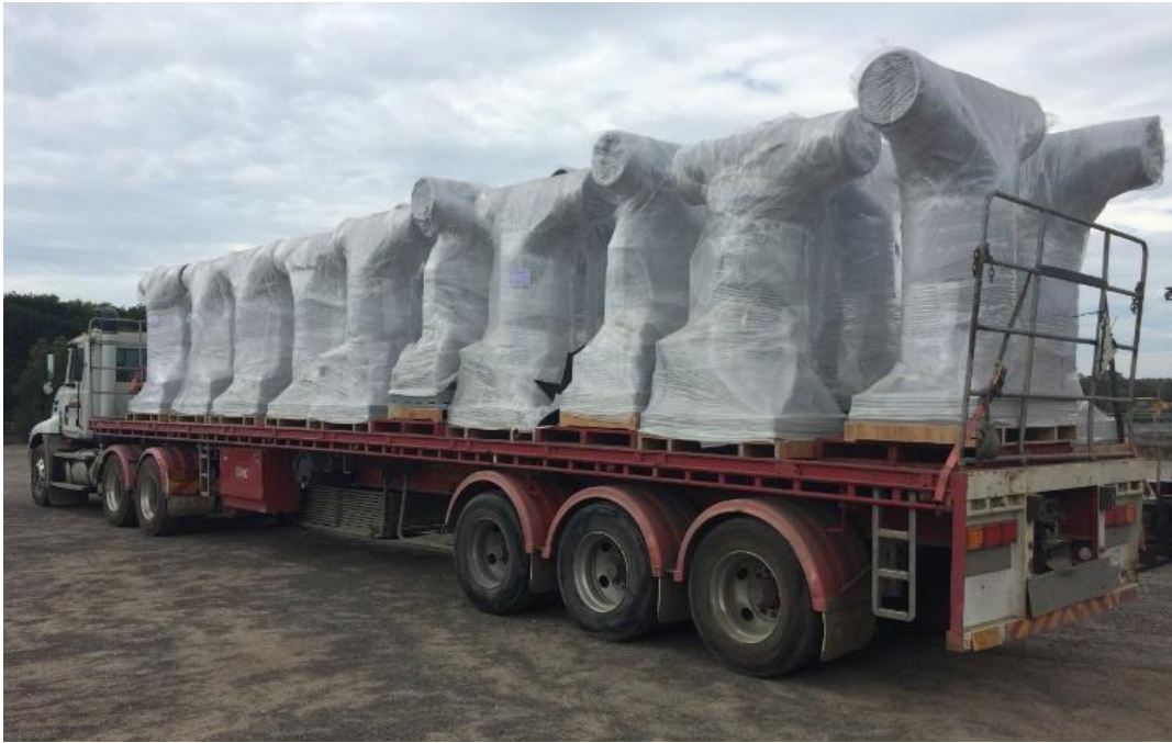
Image 5. First shipment of AWCS components arrive on the Sunshine Coast