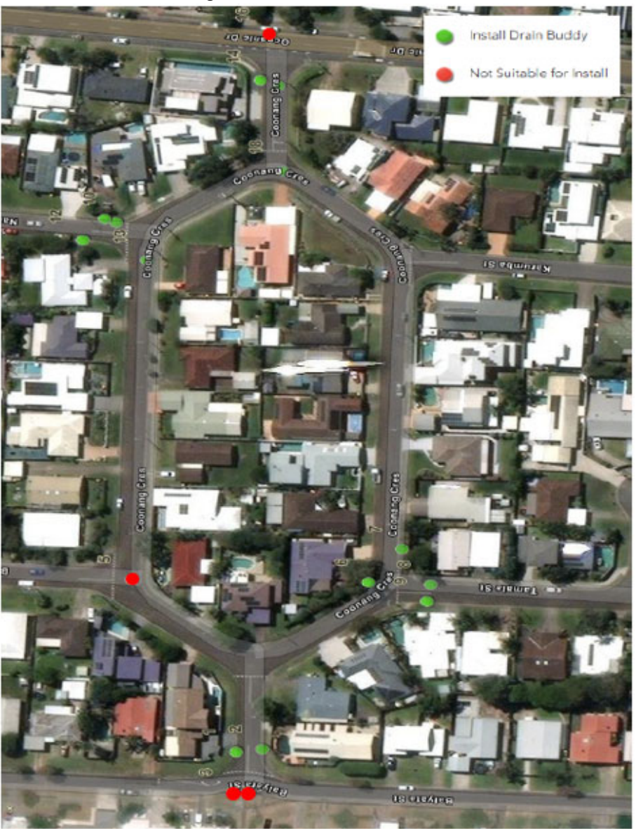
Figure 1: Litter Basket Locations