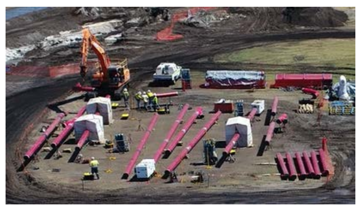
Figure 4. Stage 1A – AWCS Pipe Preparations