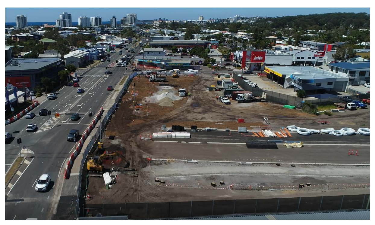
Figure 6. Aerodrome Road Intersection Works