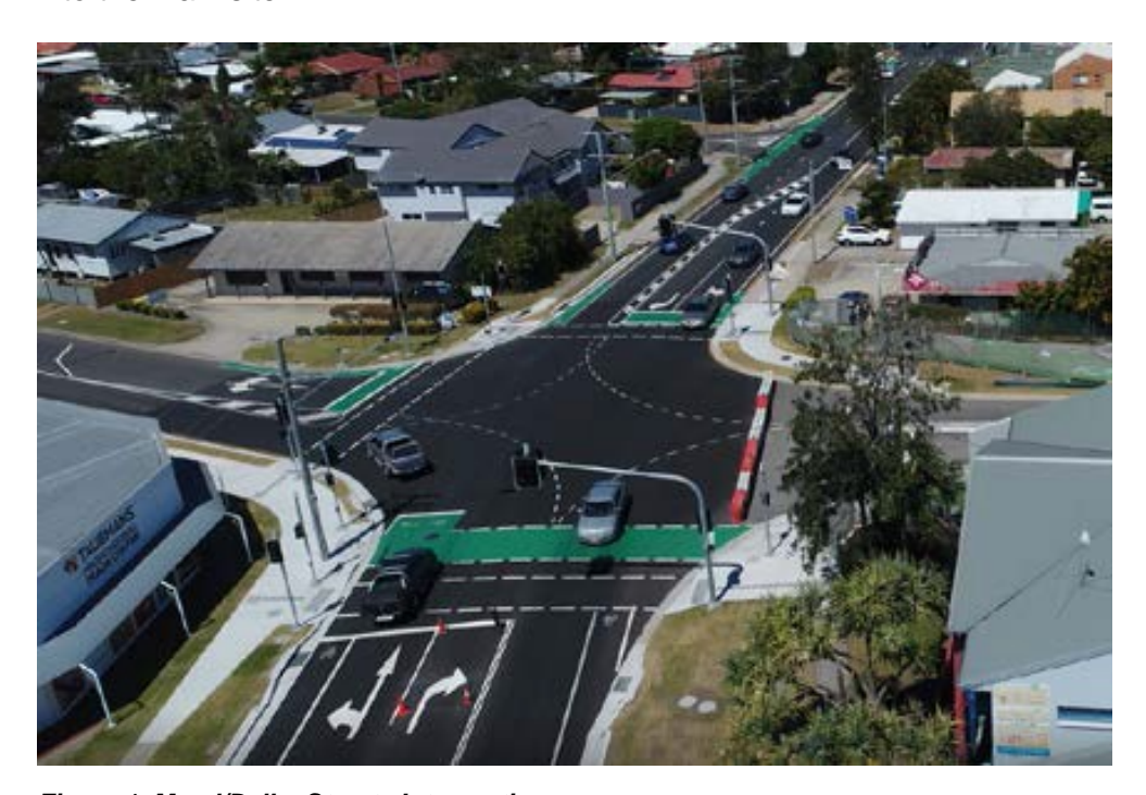
Figure 1. Maud/Dalby Streets Intersection

The works on both Maud Street intersections (Figures 1 and 2) are now complete and on maintenance. These intersections are due to open during 2018 and will provide early access into the main site.