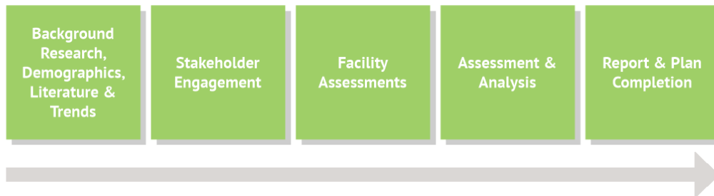
Figure 1: Project Stages