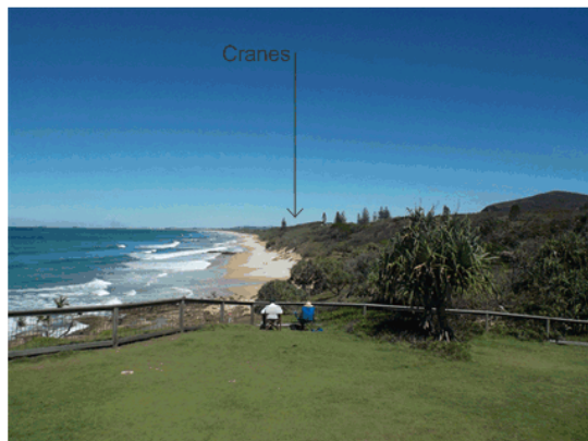
Figure 24: Photo From Near Vantage Point Showing Cranes