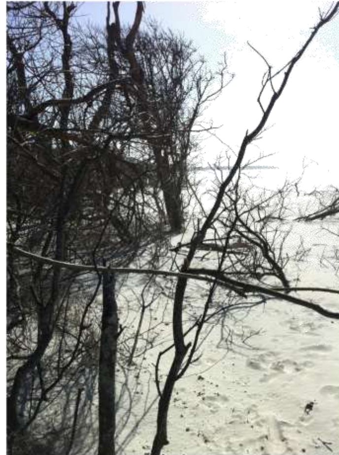
June 2013 (loss of 30.55+ m)