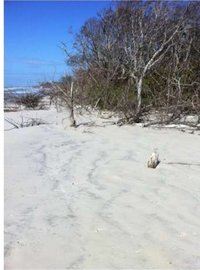
June 2013 (loss of 41.22+m)