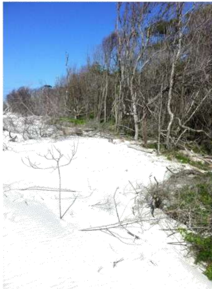
June 2013(loss of 30.55+ m)