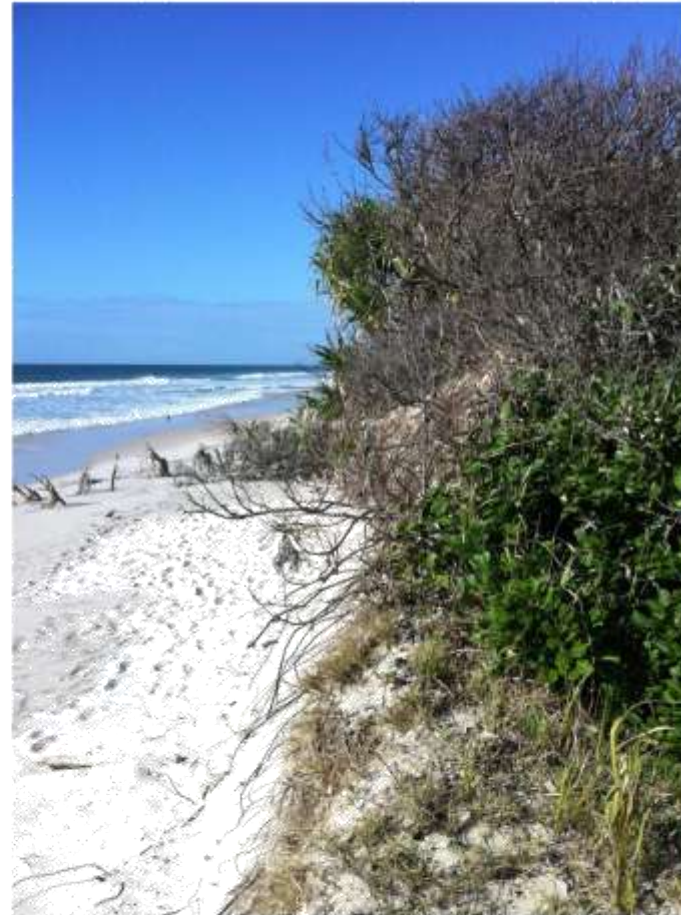
June 2013 (loss of 18.06m)