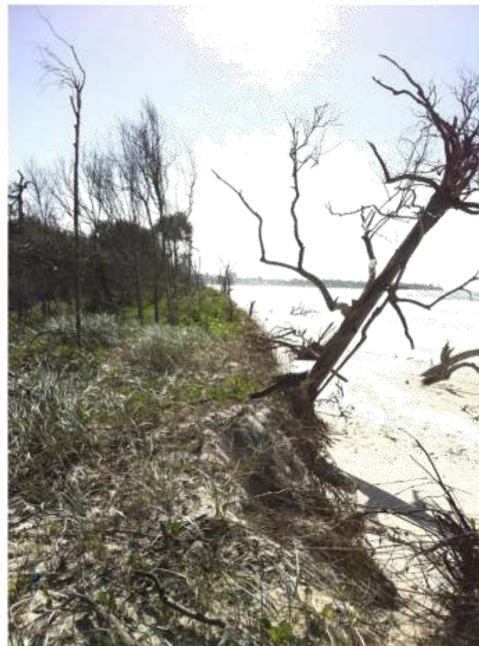
June 2013 (loss of 15.6m)