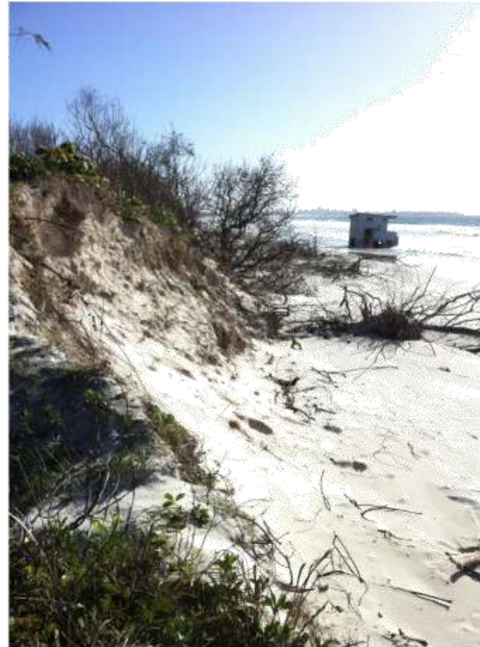
June 2013 ( loss of 18.06m)