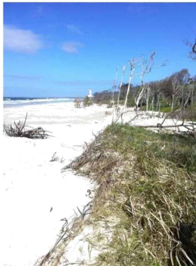
June 2013 (loss of 15.6m)