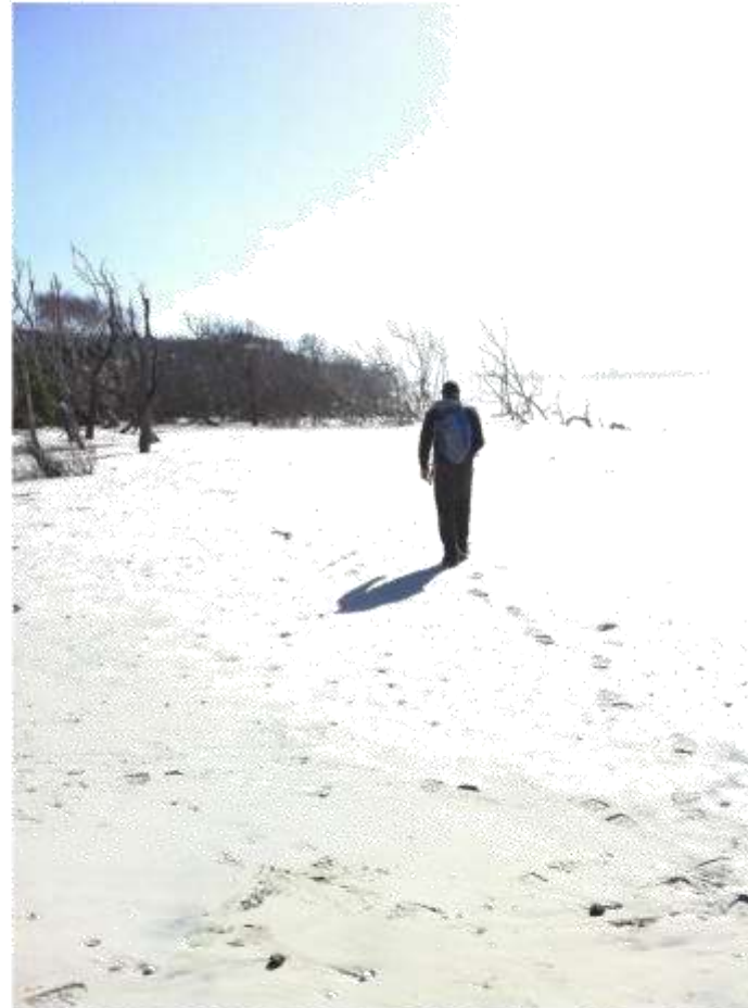
June 2013 (loss of 41.22+m)