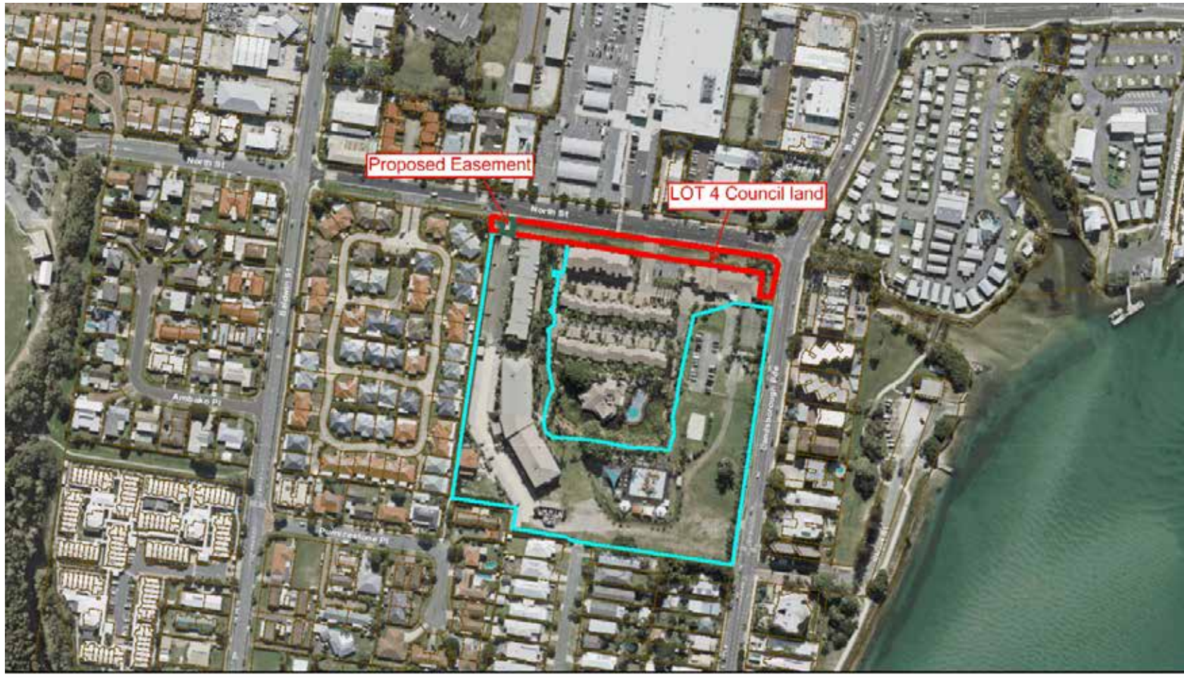
Proposed Access Easement North Street