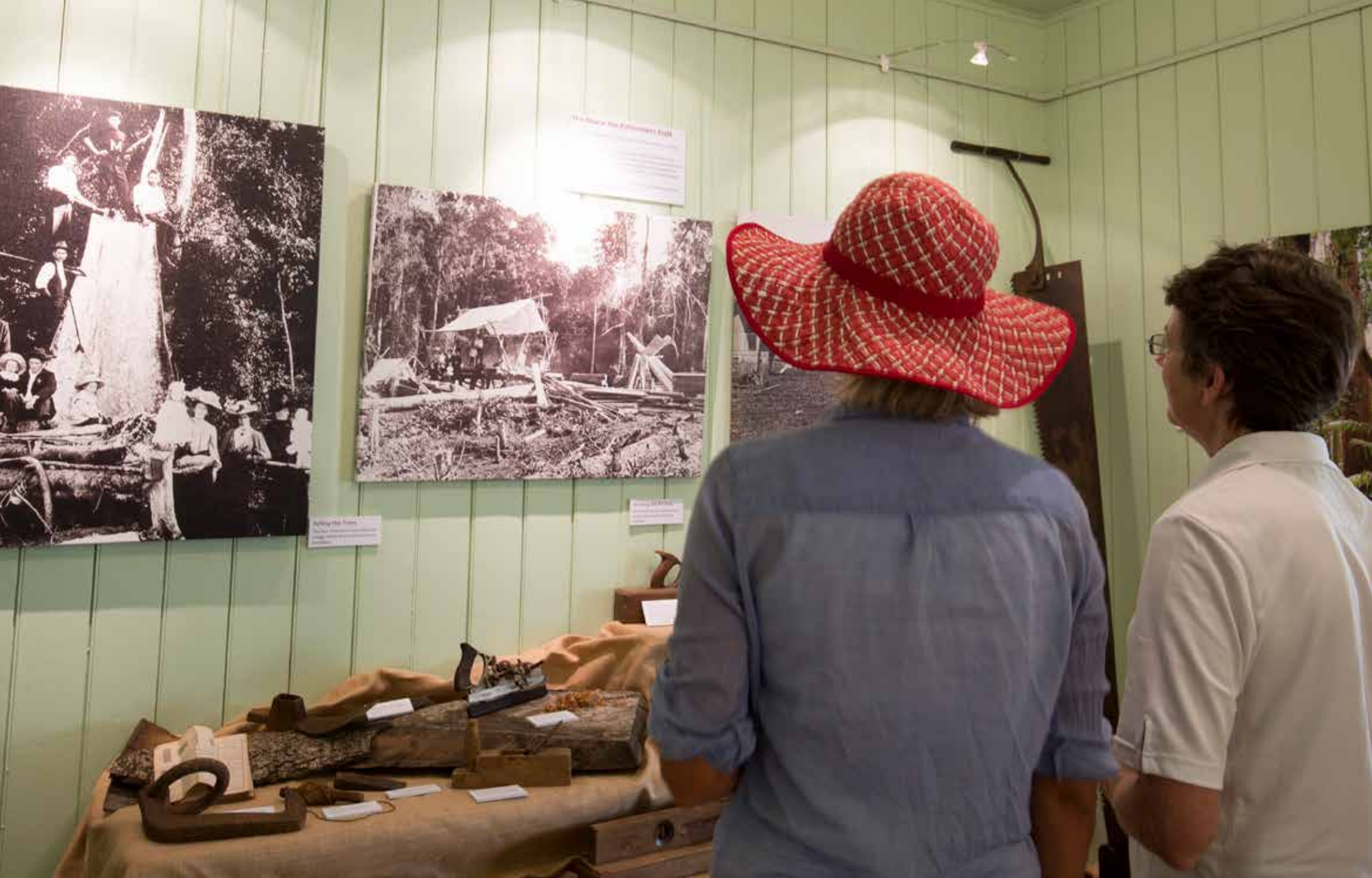
Use the saw the following way