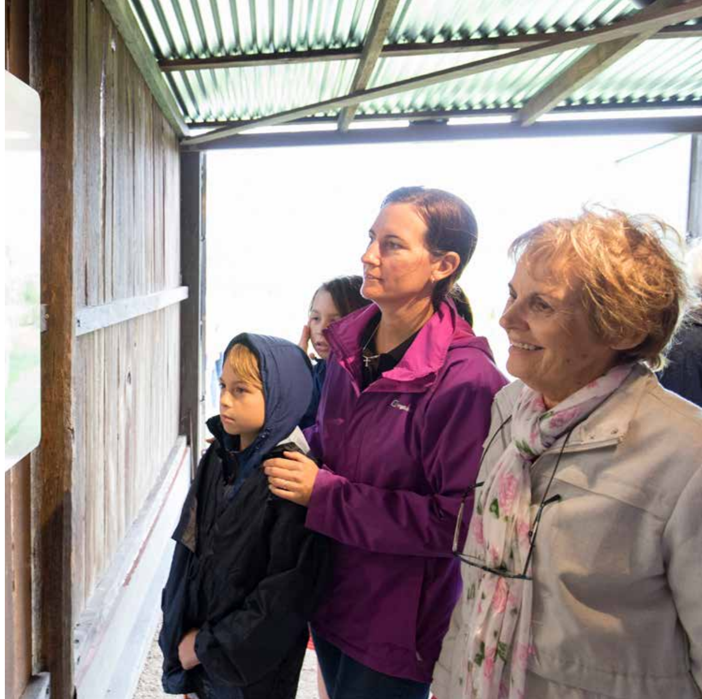
Bankfoot House Heritage Precinct 150th event 2018.

The Bankfoot House Heritage Precinct Interpretation and Promotion Project encompassed interpretive strategy, new permanent exhibitions, introduction of temporary exhibitions, new tour guide format, revised museum displays, interactive experiences, digital stories, film and images, public and education programming and events. A most important outcome has been the demonstration of how exhibition and interpretation can raise the benchmark for visitor experience on the Sunshine Coast.