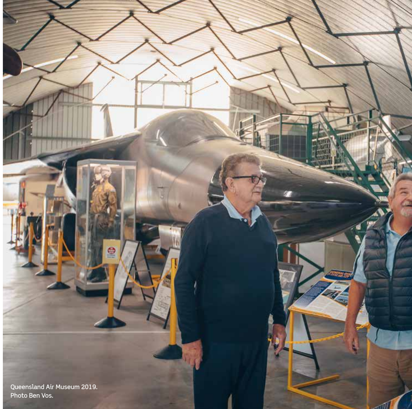
Queensland Air Museum 2019.

Council will ensure that these custodians have the support they need to care for the region's heritage assets, and have the skills and resources to ensure good conservation practices. Mechanisms will include