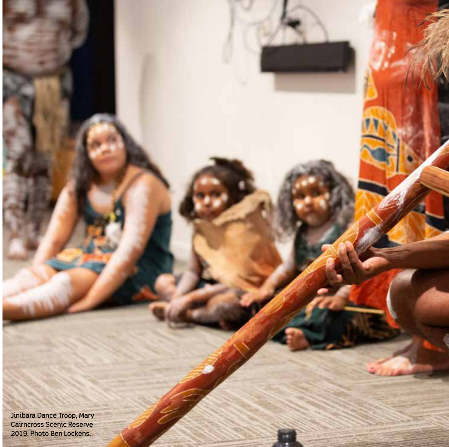
Jinibara Dance Troop, Mary Cairncross Scenic Reserve 2019.

Council's heritage library is a key community resource, which currently provides a significant repository of heritage knowledge – including a local studies collection comprising photographs, oral history interviews, books, maps, newspapers, booklets, brochures and pamphlets. The continued growth of this valuable resource will provide a central knowledge base for the community. A Digitisation Plan has been prepared, and the development of an arts and heritage database is an ongoing process.