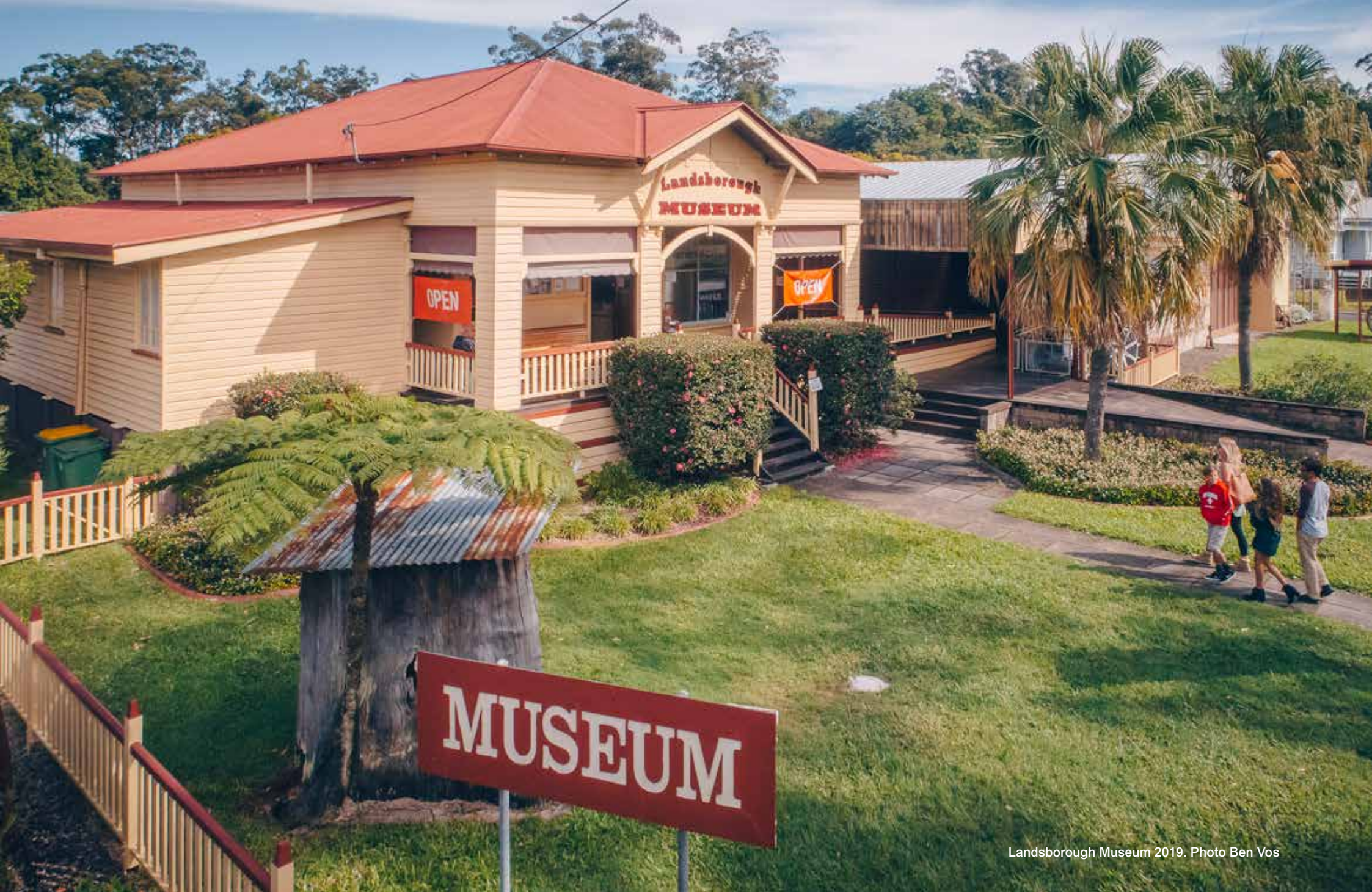
Landsborough Museum 2019.