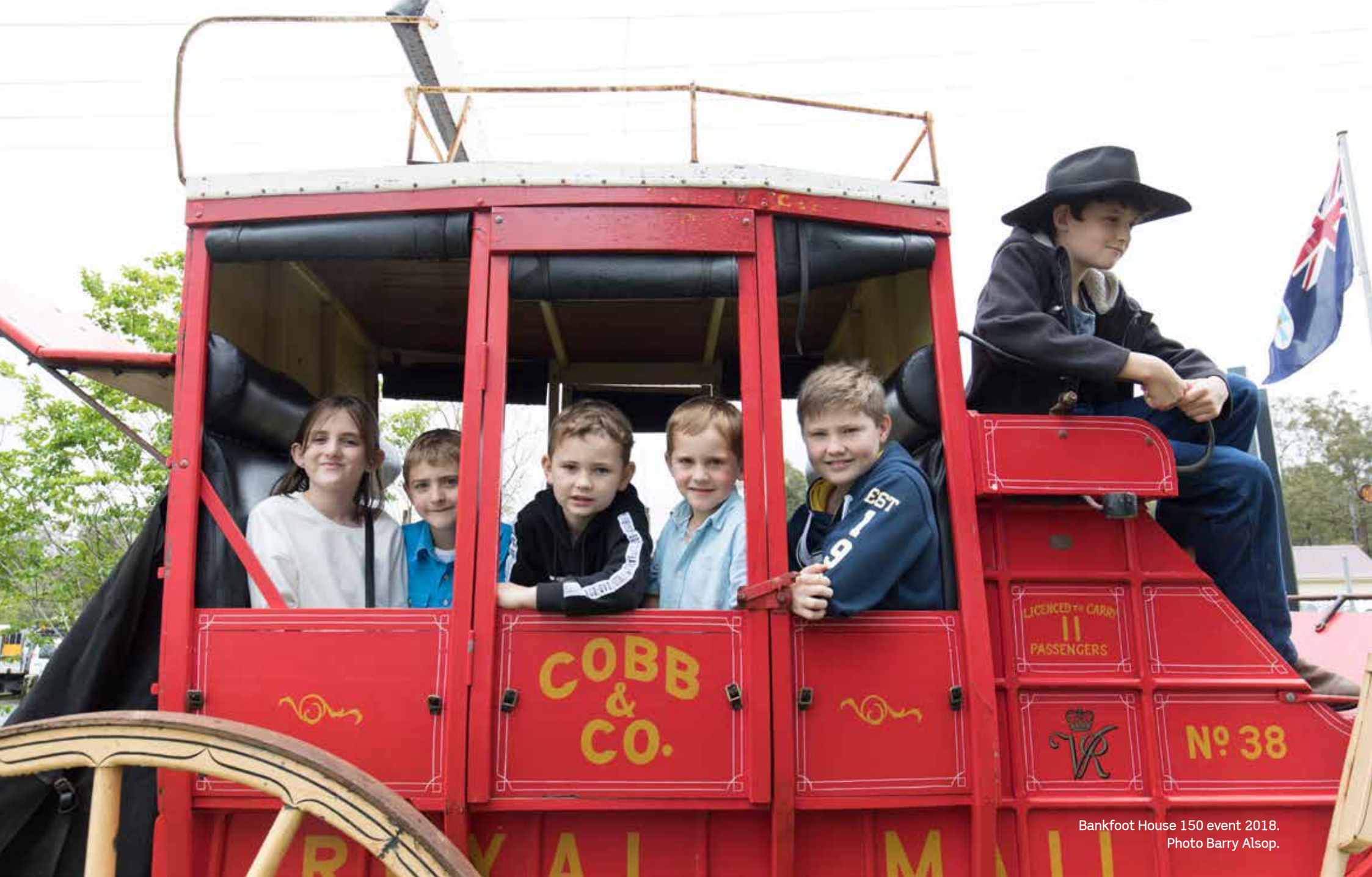
Bankfoot House 150 event 2018.