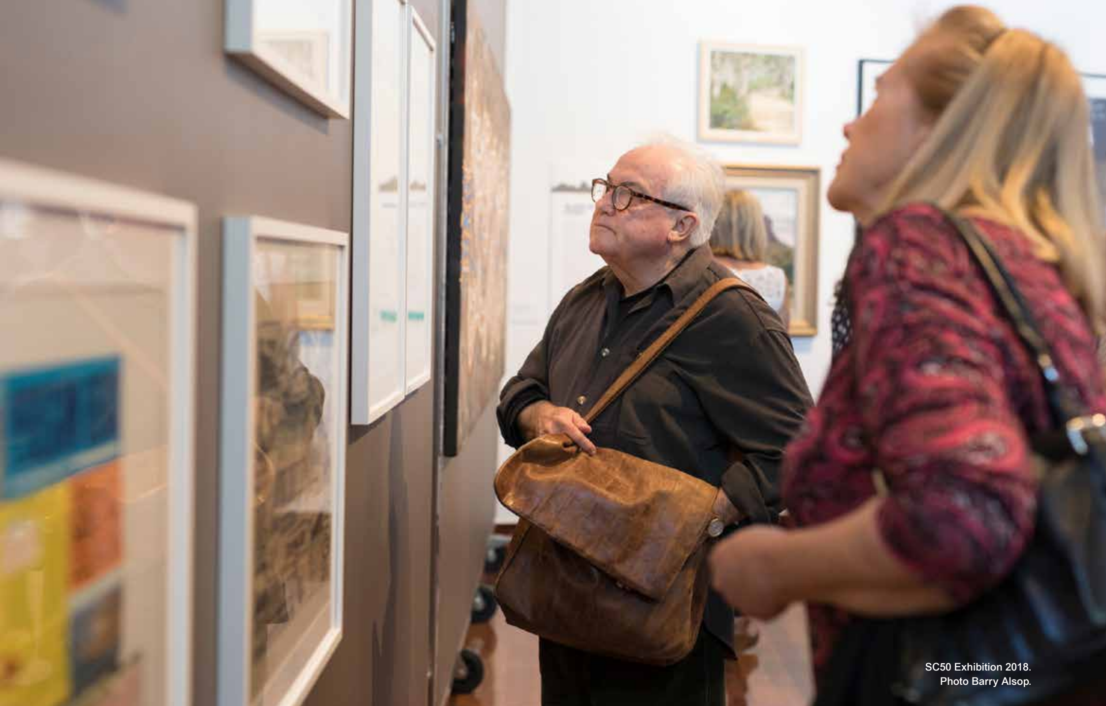
SC50 Exhibition 2018.