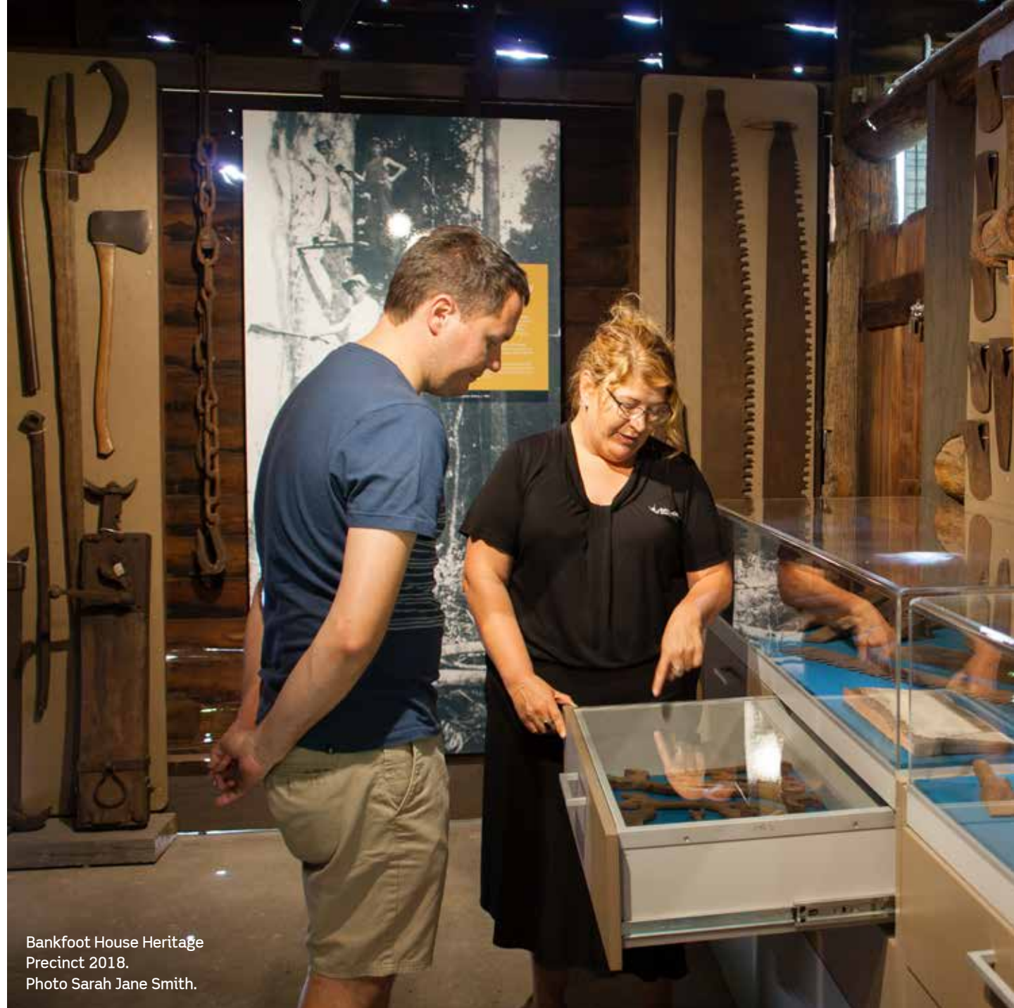
Bankfoot House Heritage Precinct 2018.

Clarifying responsibility for conservation of different elements of the built environment will be a priority