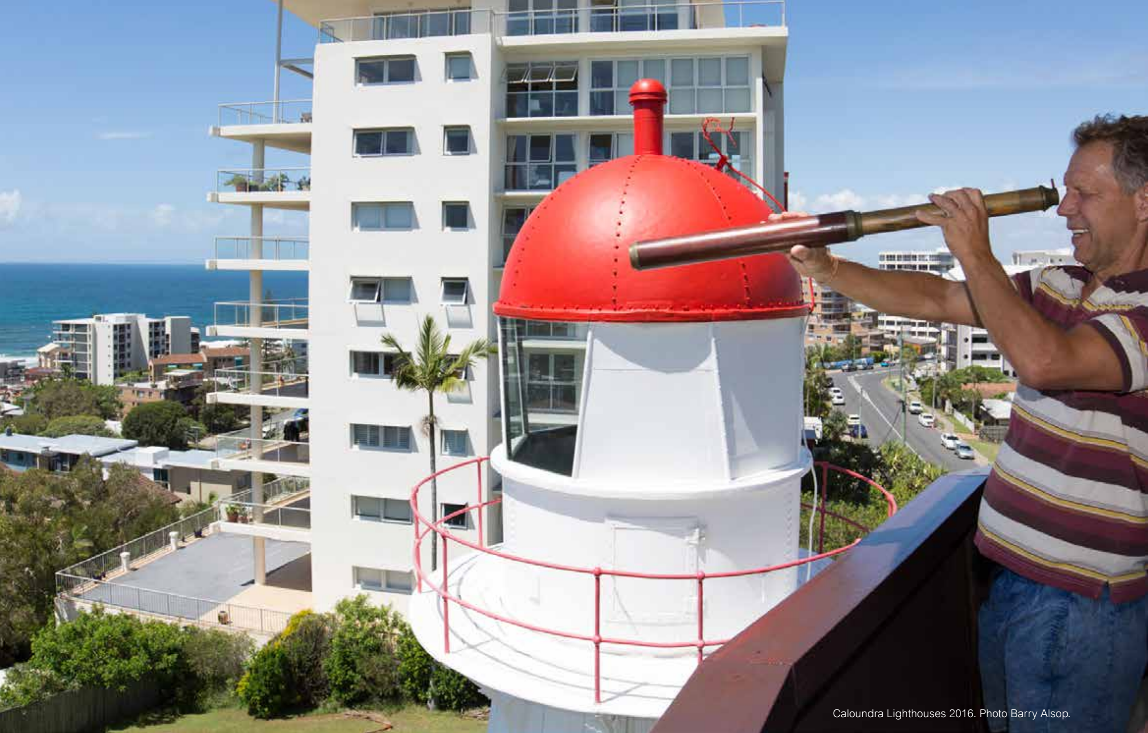
Caloundra Lighthouses 2016.