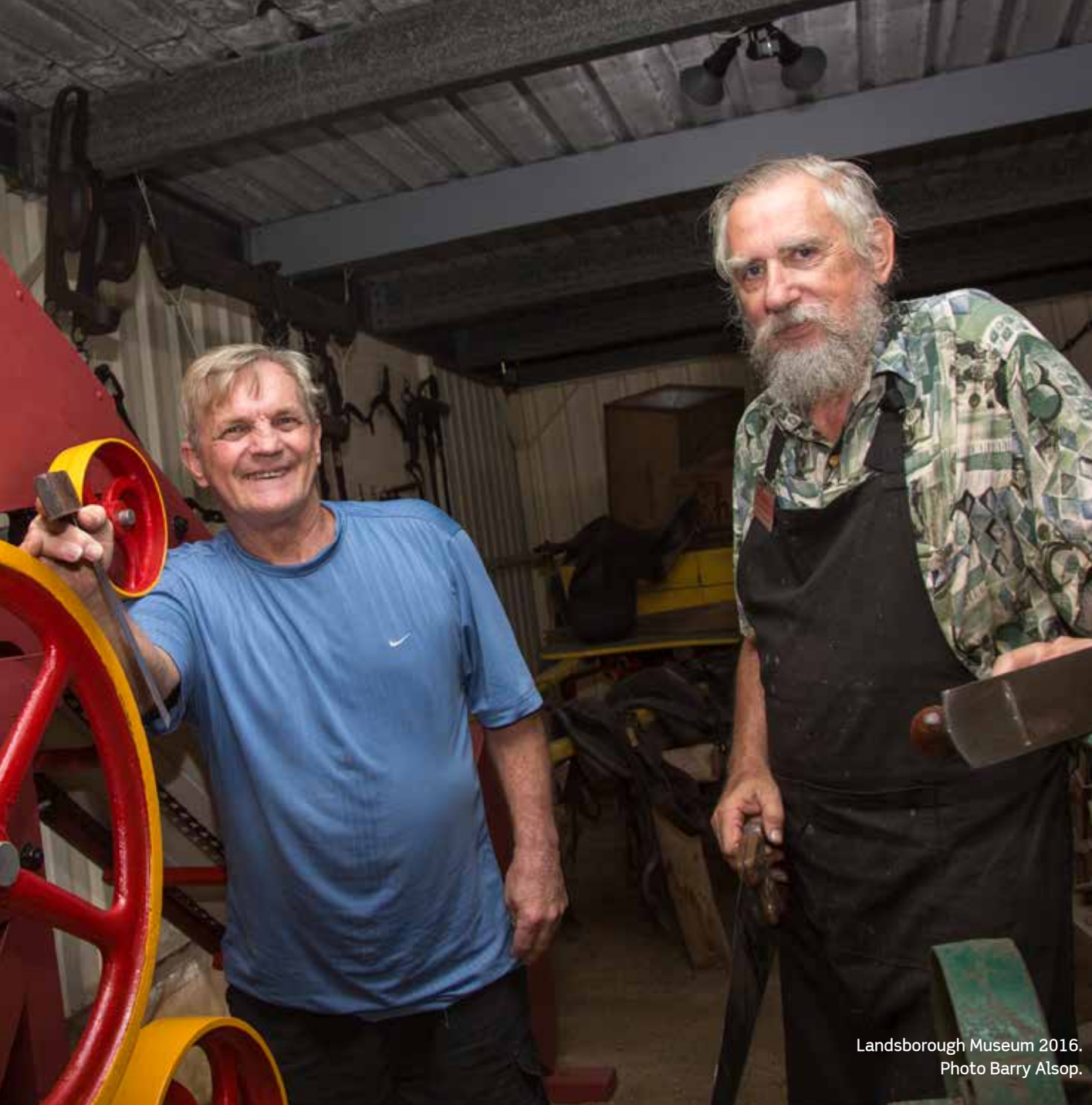
Landsborough Museum 2016.