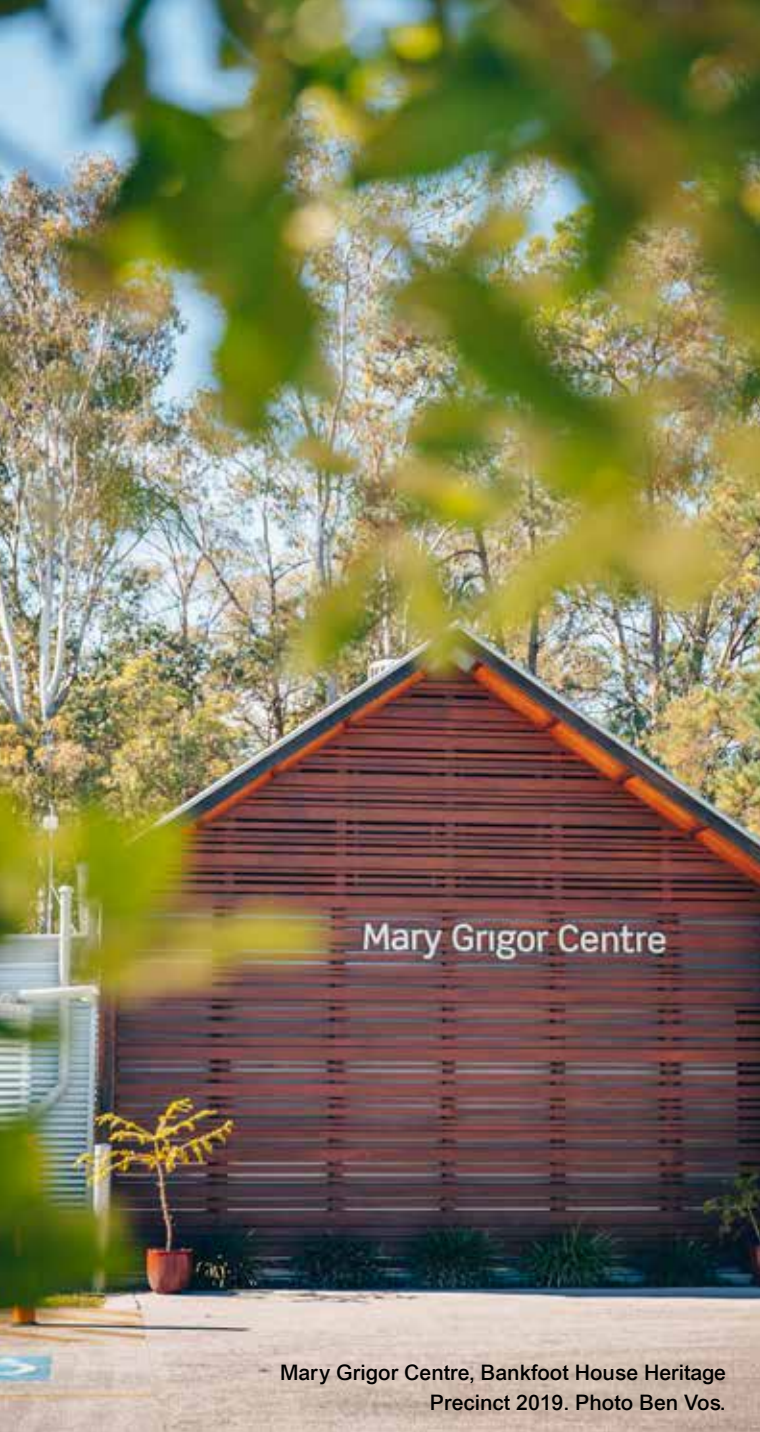
Mary Grigor Centre, Bankfoot House Heritage Precinct 2019.