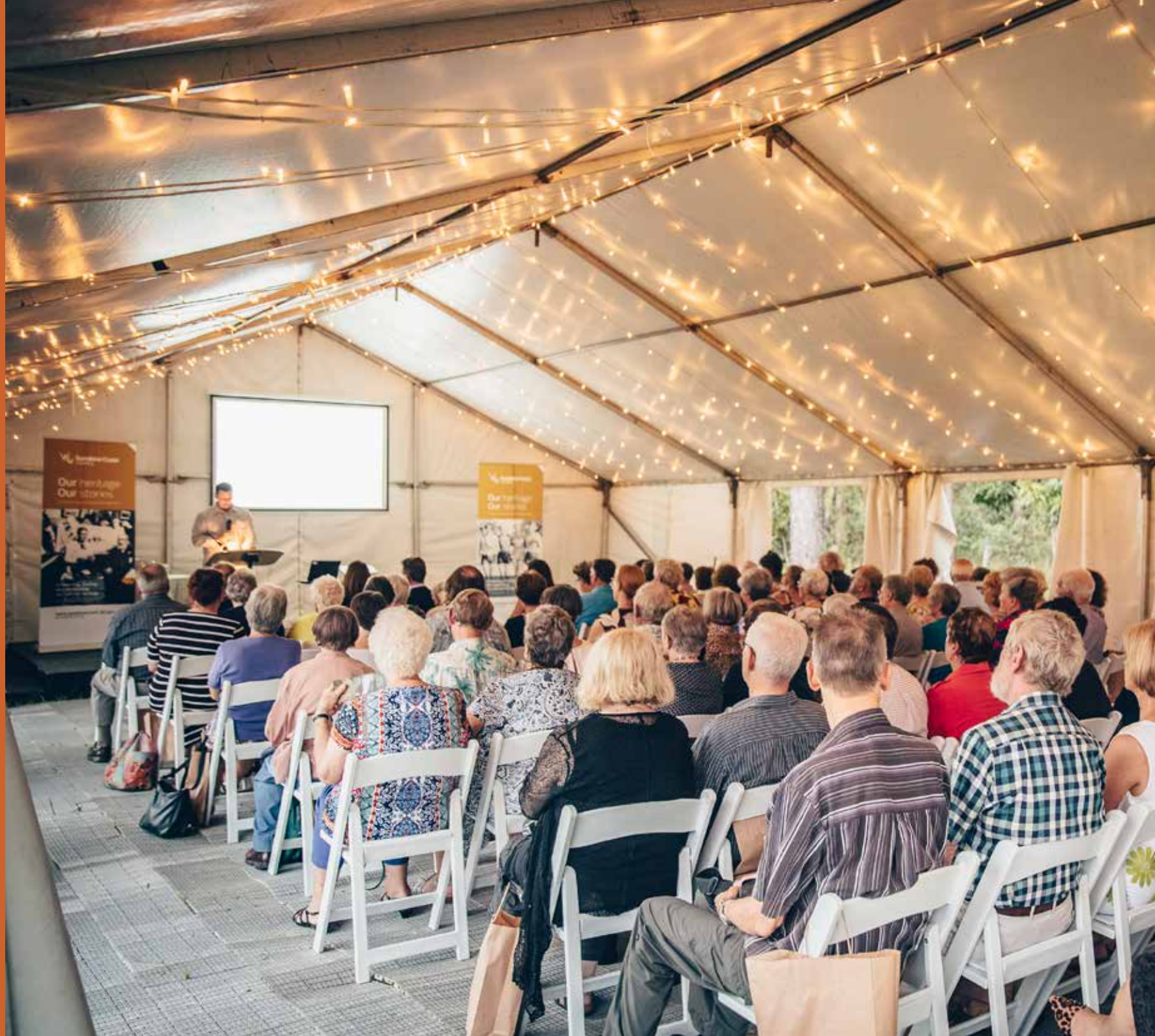
National Trust Talks 2019.