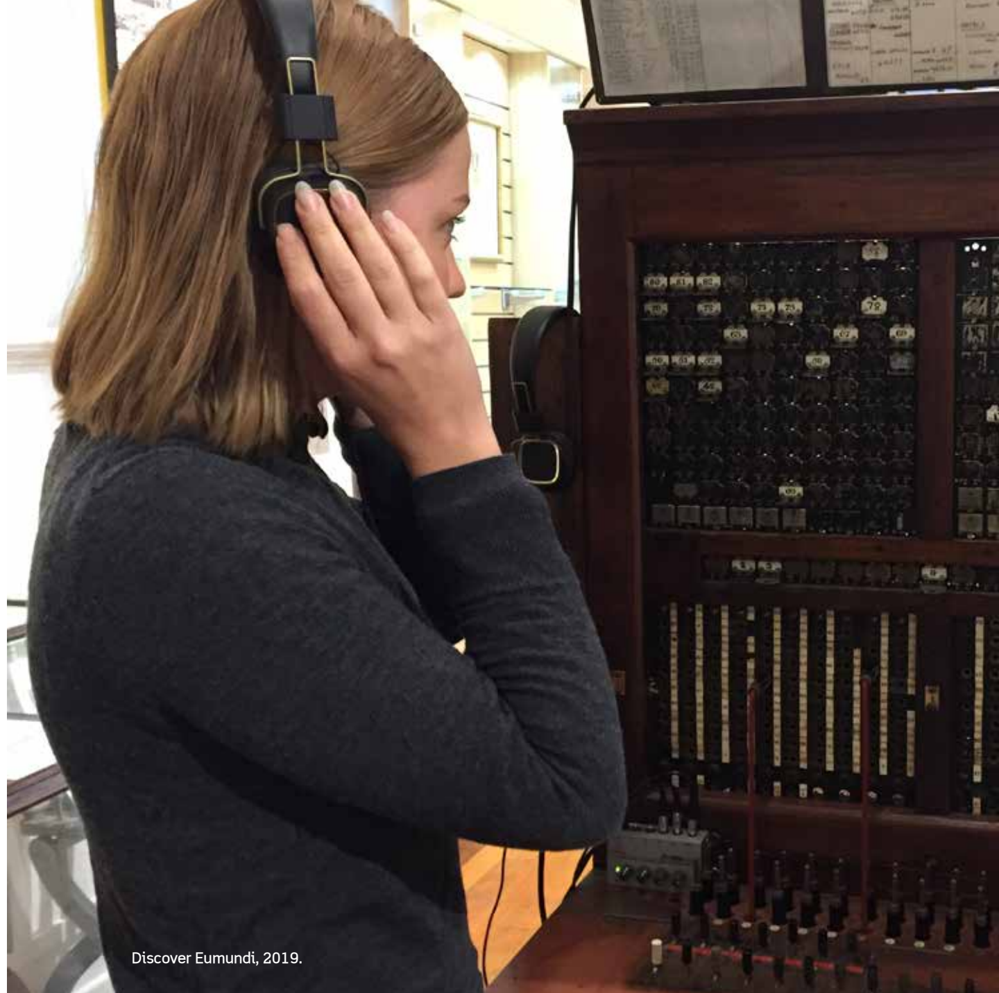
Discover Eumundi, 2019.

The Australian Government's Tourism 2020 Strategy identifies cultural tourism as a potential growth area in Australia, with the Sunshine Coast being in an excellent position to maximise this opportunity. Cultural tourists stay longer and spend more.