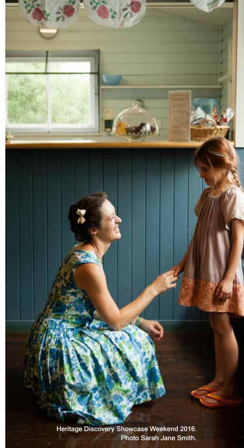
Heritage Discovery Showcase Weekend 2016.

Provide opportunities to stimulate understanding, activation and appreciation of the region's cultural heritage.