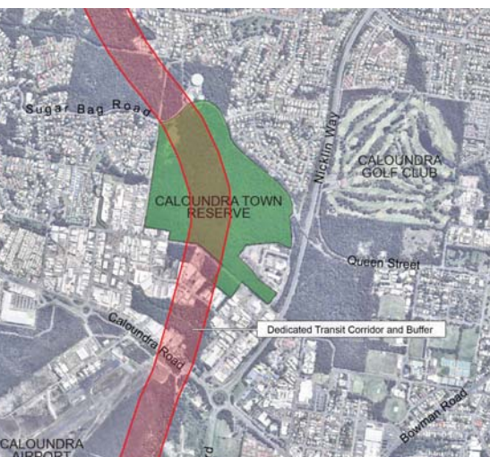
Proposed infrastructure and use of the reserve may be affected in the future by development of this State transport infrastructure corridor.