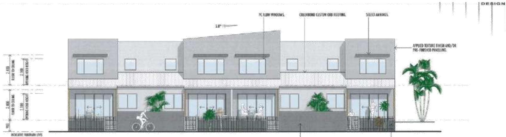
INDICATIVE STREET ELEVATION (TYPE 'A' PARTIAL)