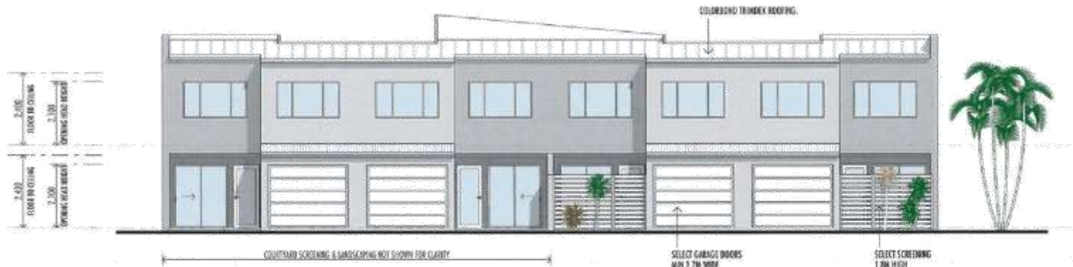
INDICATIVE DRIVEWAY ELEVATION (TYPE 'A' PARTIAL)