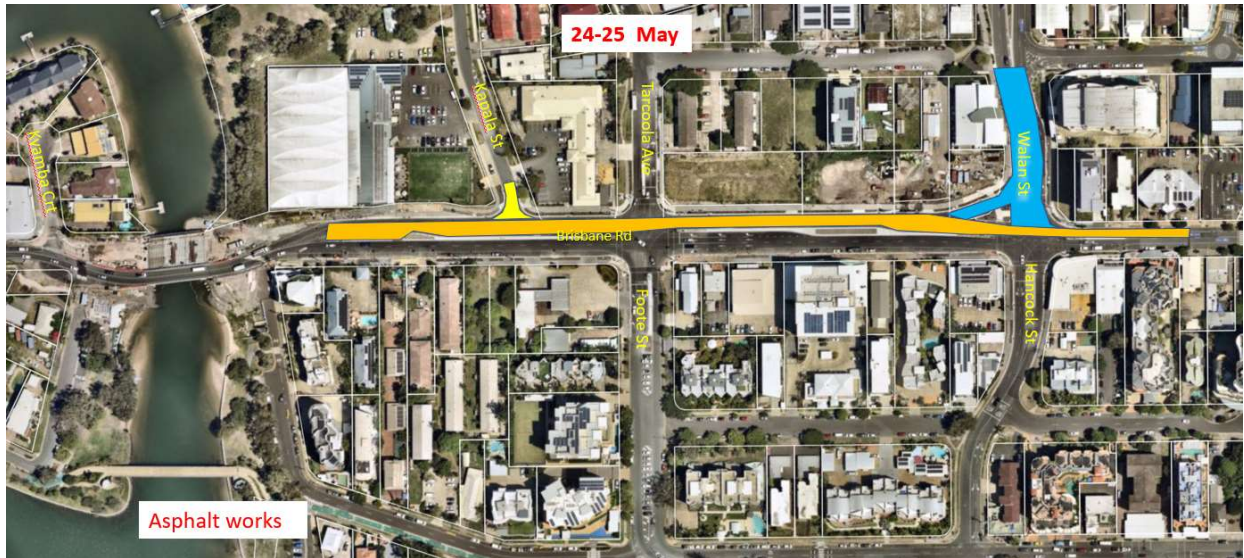
Figure 1. Night works. Wednesday 24 and Thursday 25 May, 6pm to 6am Brisbane Road Northbound (yellow section) from new Mayes Canal Bridge to 100 metres north of the Walan Street intersection, section of Kapala Street and partial Walan Street

One lane of traffic operating each way along Brisbane Road